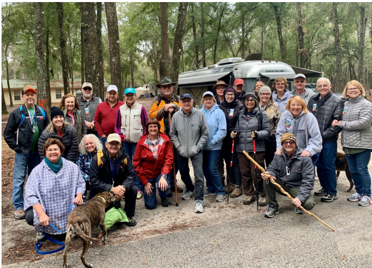
Hikers on their way to the Florida Trail by the Suwannee River