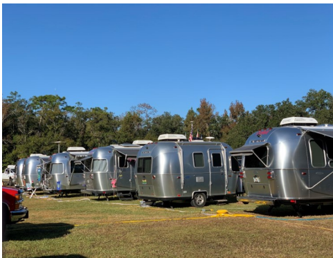
Fort Christmas Rally, 2019