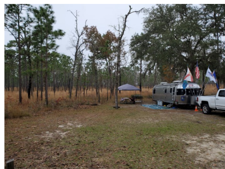
View of long leaf pine and reed grass restoration from Sandhill Loop site.

Text-In Information: Text: 844-292-2290 type marrally in the message box and send