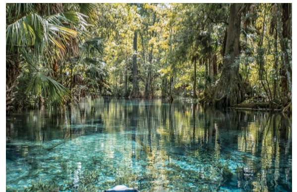
Silver Springs State Park, FL

Try this website if you really want to snatch a site as soon as an opening appears.