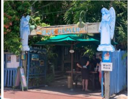
Scenes from Key West and Dry Tortugas, sunrise and sunset