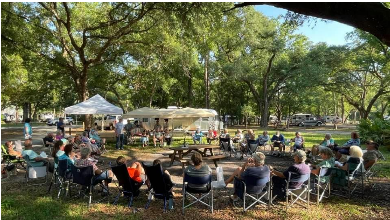
Happy Hour social under the oaks at Highlands Hammock State Park, April, 2021