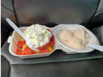
Winner of the Best Strawberry Shortcake Contest, Bayless Highway Church Youth Dept.