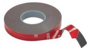
3M Double Stick tape