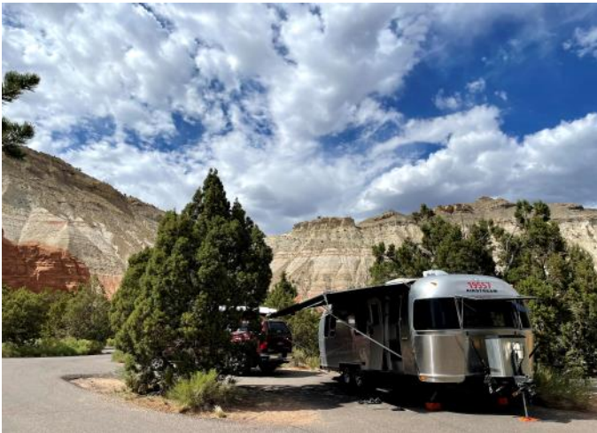
Kodachrome Basin State Park , Cannonville, UT