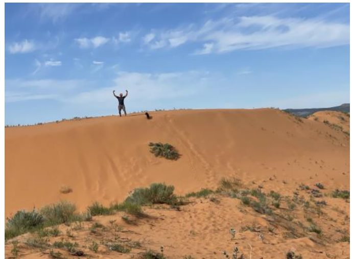
Coral Pink Sand Dunes State Park in Kanab, UT