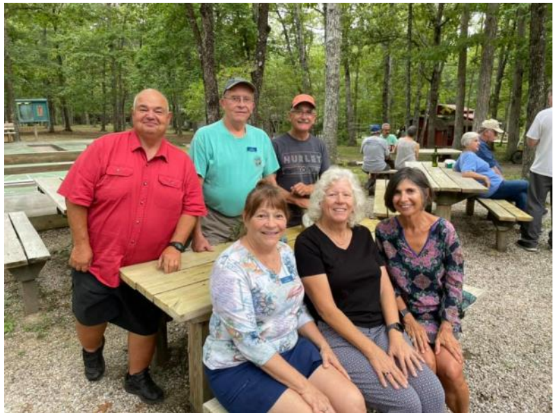
Meeting up at Tennessee Cumberland Plateau Airstream Park before heading off in all different directions. Beautiful park. Great to see familiar faces.