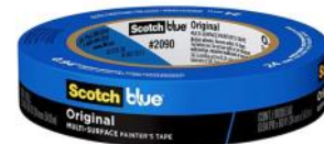
Blue masking tape