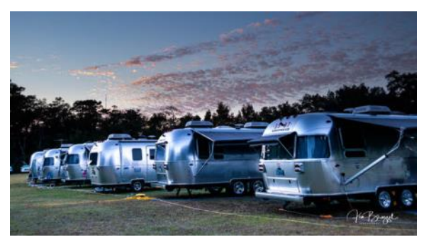
ing until AFTER the festival has ended each day and we encourage you to stay until Monday after breakfast. We've had a 34' Excella join us for years, so any size Airstream is welcome!

Arrival is Thursday 9am to dusk (before the induction dinner, please!) and Friday 8am to dusk. Please no trailer traffic leav-