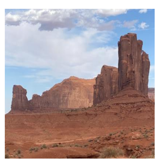
Grand Canyon National Park, North Rim

Our long-awaited Southwest Adventure Caravan (we've been registered since 2018) was all we had hoped for and more. We spent seven memorable weeks exploring the Four Corner states, starting in Albuquerque, discovering northern New Mexico and southern Colorado, visiting the big five National Parks in Utah, camping on the north rim of the Grand Canyon, learning about Indian cultures in all four states and ending with the Albuquerque Balloon Fiesta. Much of the caravan was spent at elevation with camp sites ranging from 4000 - 8000 feet and typically summer temperatures ranged from the 40s - 80s. For the almost native Floridians that we are, our eyes were opened to the cultures, climate, history, and drastically different landscapes of the region.