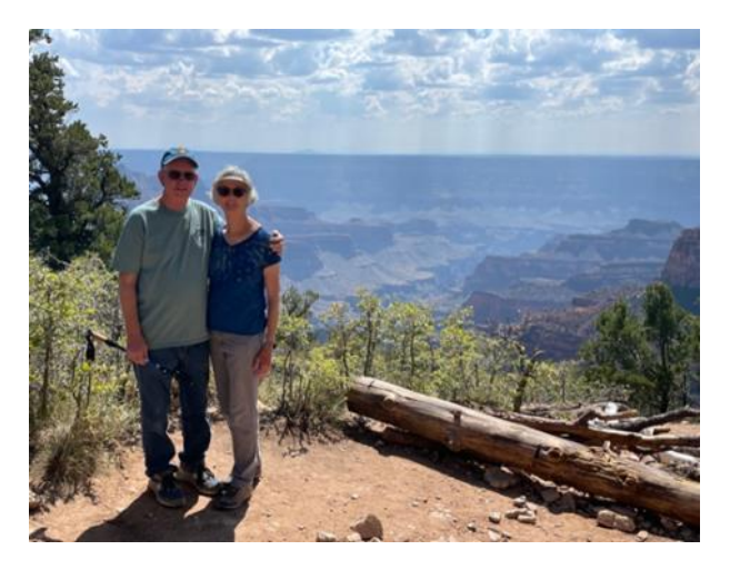
Grand Canyon National Park, North Rim