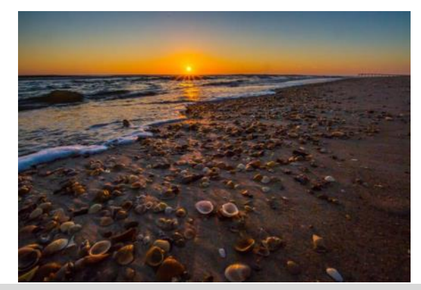
Come to experience the pristine white sand beaches and vibrant history of St. Augustine

We are currently planning a private trolley tour for our group. The cost would be $22.00 if we could collect all of the money ahead, then pay with one payment. This would need 20 people commit to it. Otherwise it is $28.99 per person (but it would still be a private tour if we had 20 people) So please reach out to us via email if you would be interested in participating in a 1 hour 9 mile St. Augustine Trolley tour. They would even have a shuttle to pick us up from the state park included in the above prices. So there are no worries to find a place to park. After the tour you get to ride the trolley and get on and off as many times as you would like to. The shuttle would take you back to the state park. https://www.trolleytours.com/st-augustine