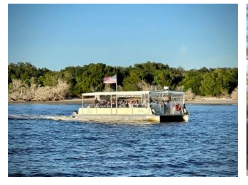
Sunset Dolphin Cruise