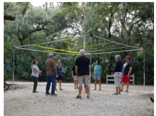
"Nine Square in the Air" ball game