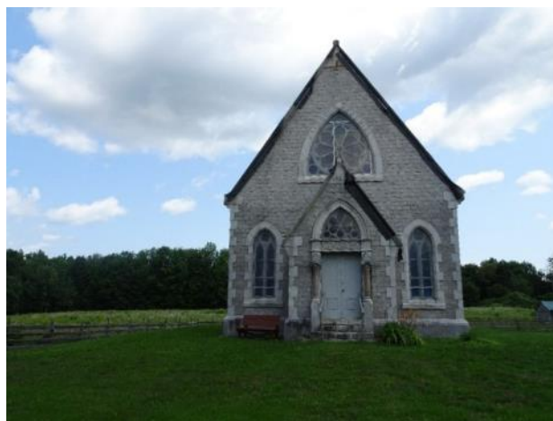
Norland's Church, Livermore, ME.