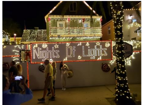
St. Augustine's famous Nights of Lights

New Year's Eve Day we had a rally breakfast where breakfast sandwiches and homemade waffles were a hit. People stayed longer to visit and play a game of "9 Square in the Air". Some then went on to site seeing while oth-