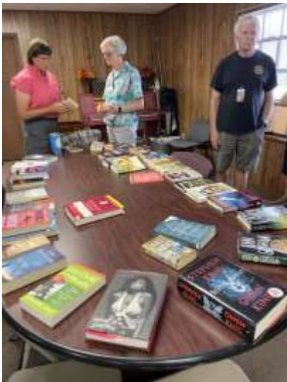
Book exchange participants