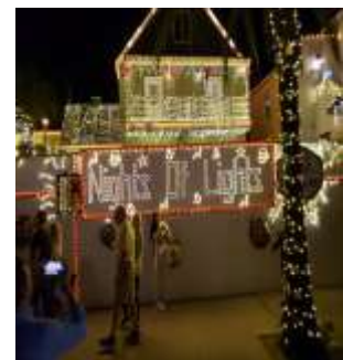
St. Augustine's famous Nights of Lights