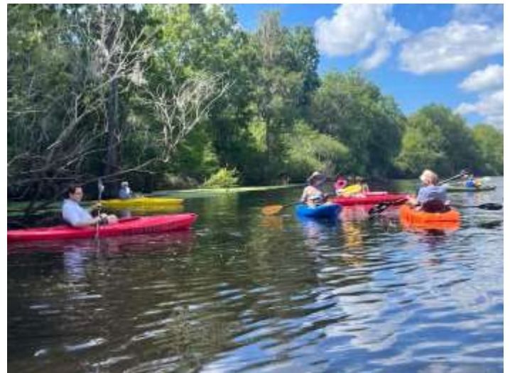
Paddlers at the mouth of Otter Springs run on the Suwannee River