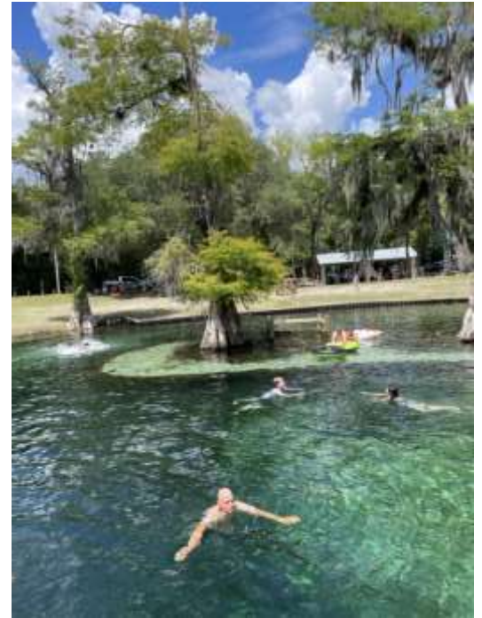
Swimming at Hart Springs, which along with Otter Springs, drain into the Suwannee River