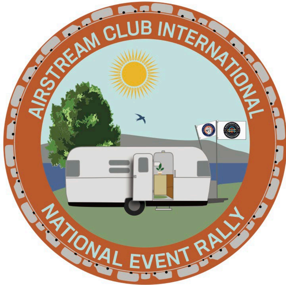
Exhibit 3: Proposed National Event Rallies logo