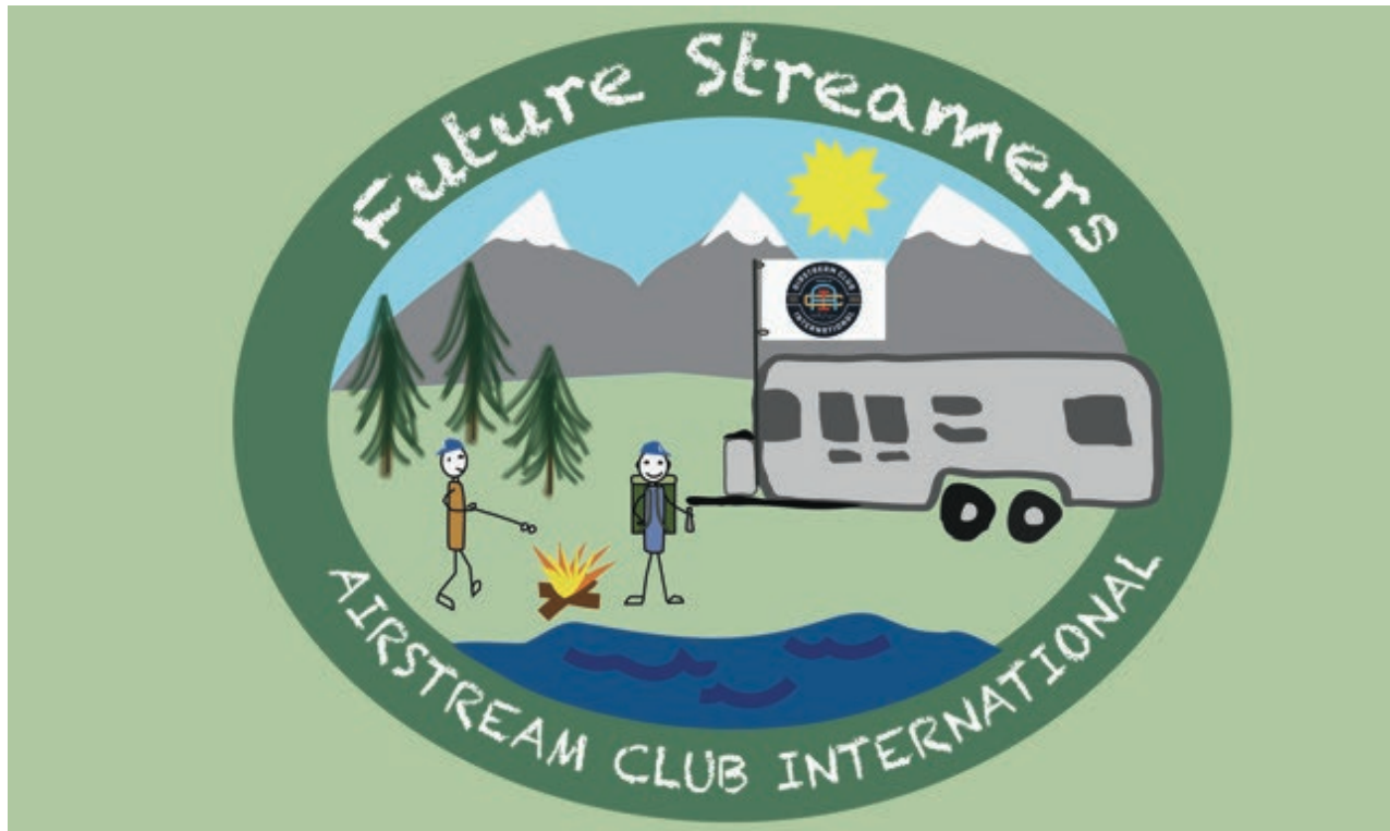
Exhibit 1: Flag Design