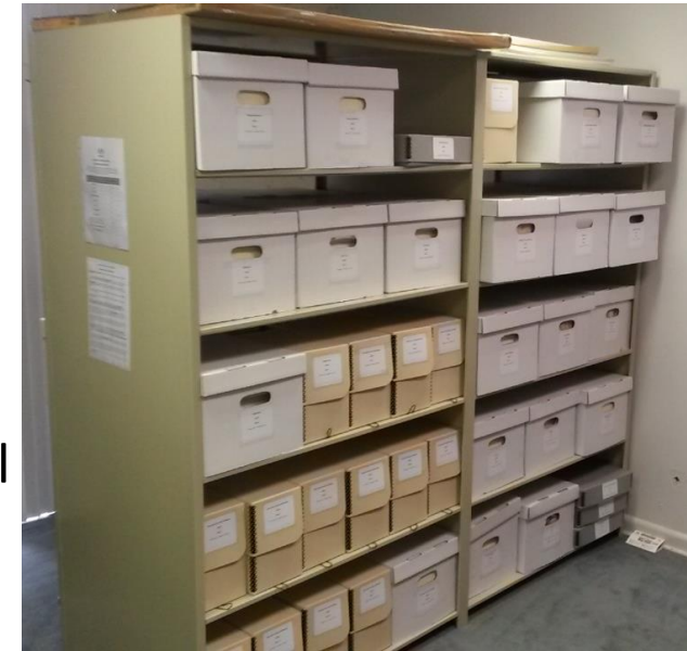
Airstream Archive Example