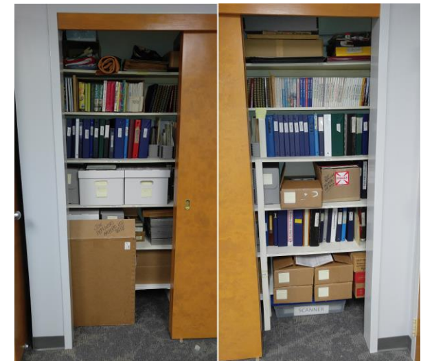
WBCCI History Closets