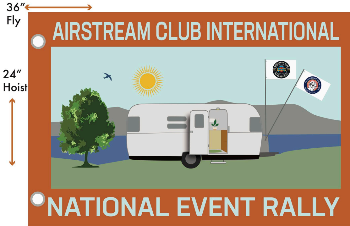
Exhibit 4: Proposed National Event Rallies Host Pennant