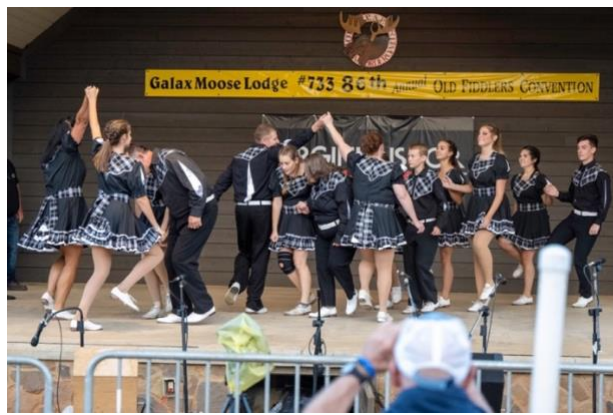
Dancers on stage performing clogging aka flatfooting