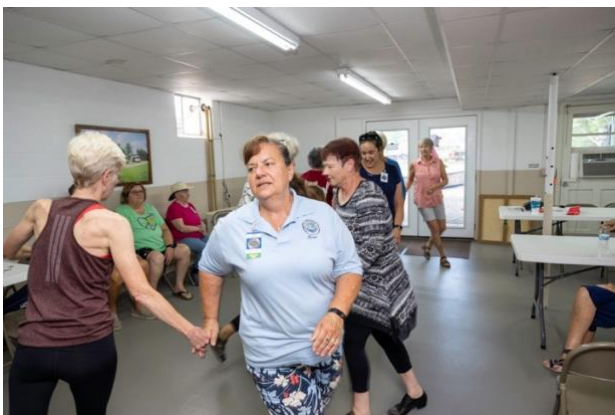
Airstreamers caught flatfooted? – No way, we are just learning how to perform the dance – known as flatfooting