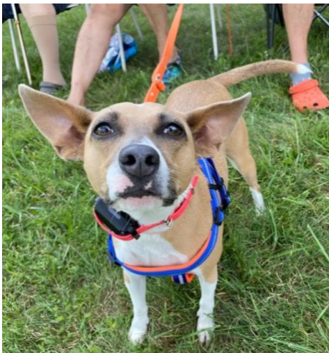
Cricket Rider enjoying the music.