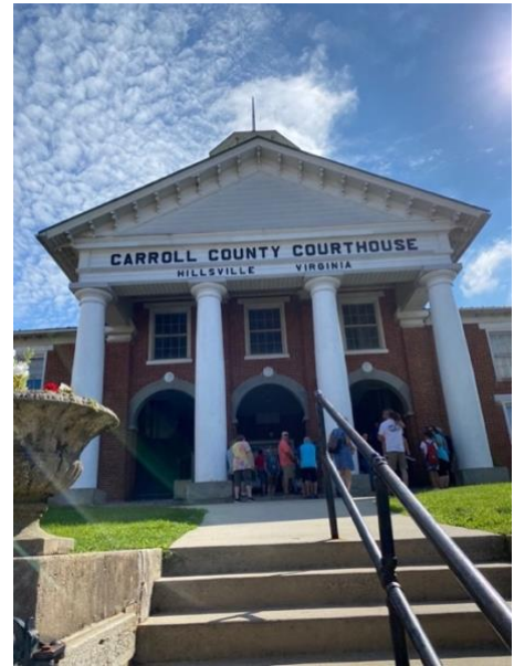
Site of the Hillsville shootout