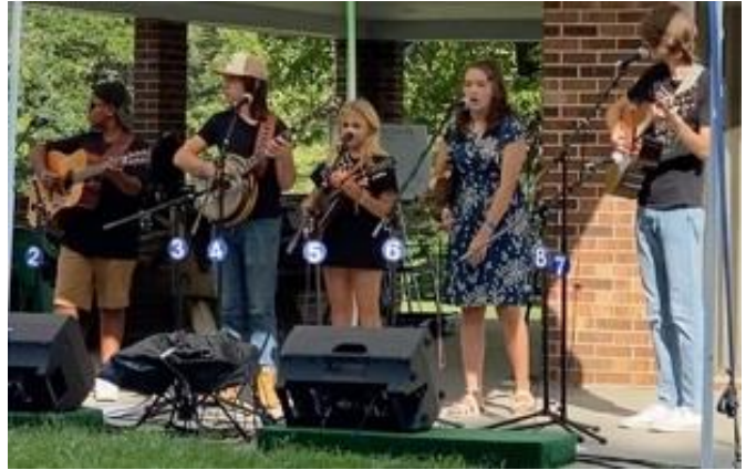
Grand Prize Winners of the prestigious Youth Competition giving us a private concert at our campground. What a treat!