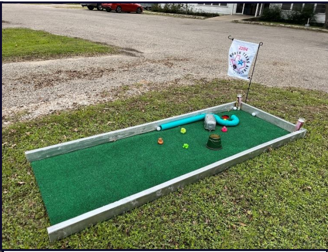
Most creative of 10 holes from the Pappas's