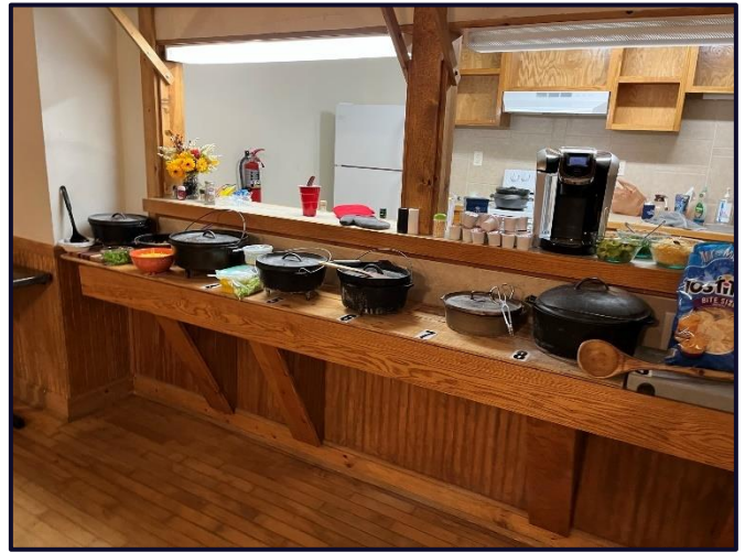
Eating the fruits of our labor and inducting new Officers and members