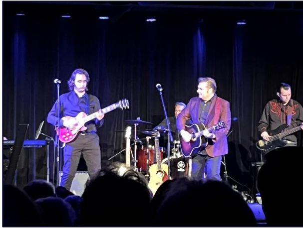
Friday night- Pizza and a concert