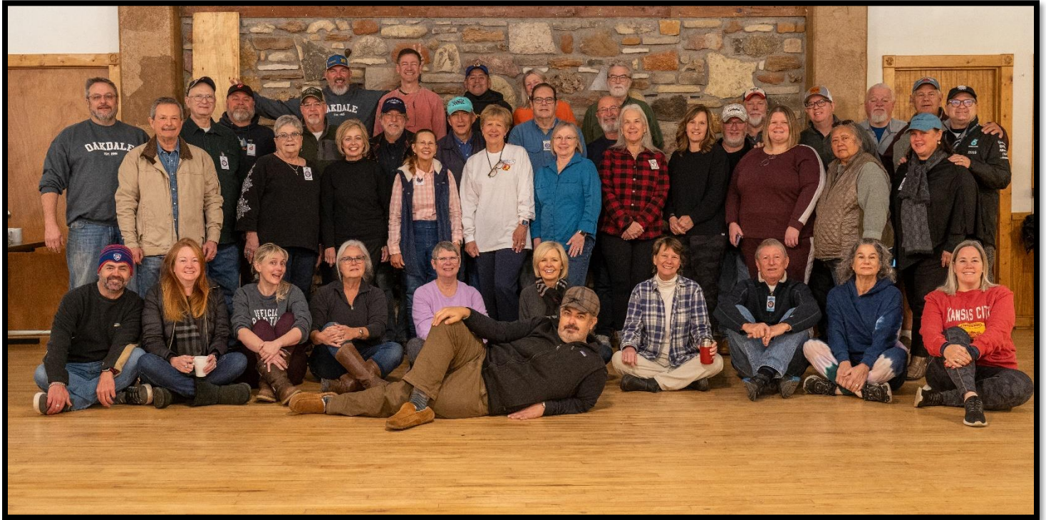
The Oakdale attendees of North Texas Airstream Club November 20, 2022