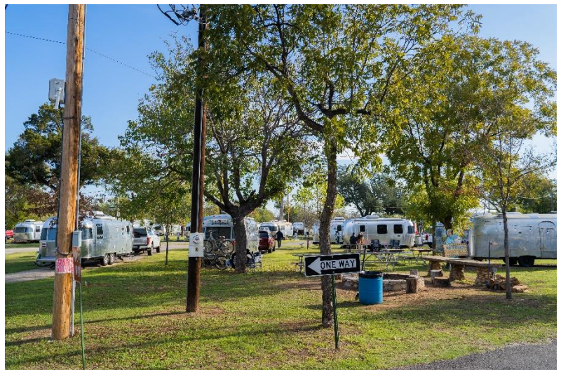
A beautiful day of Airstreaming