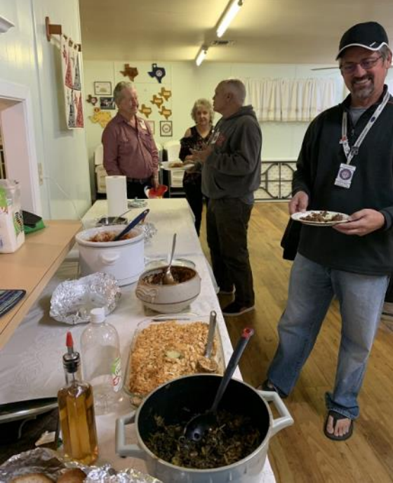
Pics of the park and from Thursday night potluck. There was a lot of great food like fresh greens, squash casserole, homemade tomato soup, sweet meatballs, and frito pie. It wasn't all desserts this time (haha).