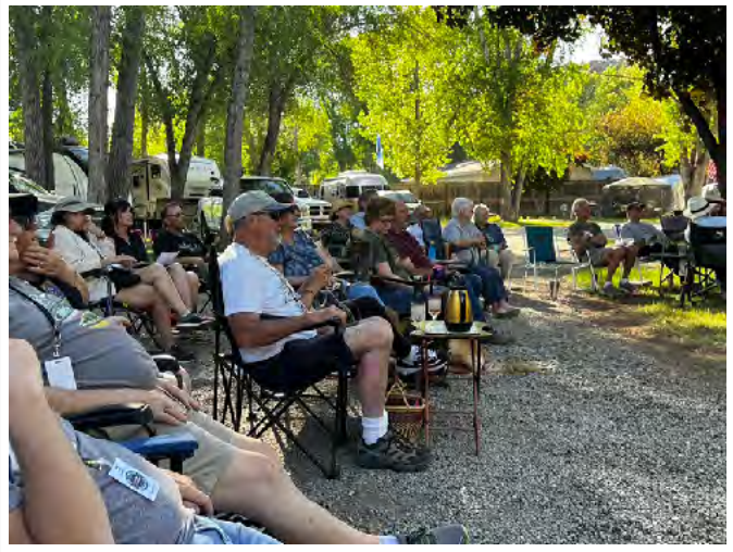
Social hours are always so much fun! Our first social hour included a short update meeting.