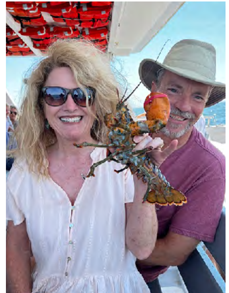
What do you do in Maine when there is an extreme heat wave? You hit the coast and eat a ton of lobster! As in almost every day! It just never got old!! And you take a boat ride or two!