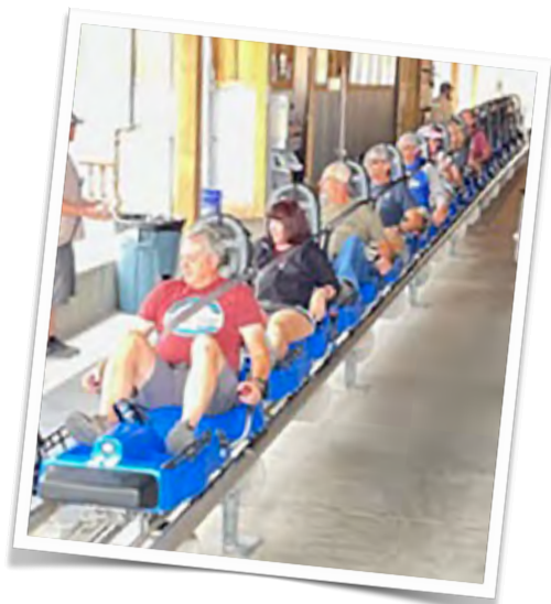
The Canyon Coaster was a real thrill!