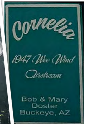
Arizona Airstream Club and Vintage Airstream Club joined rallies in Dolores, CO