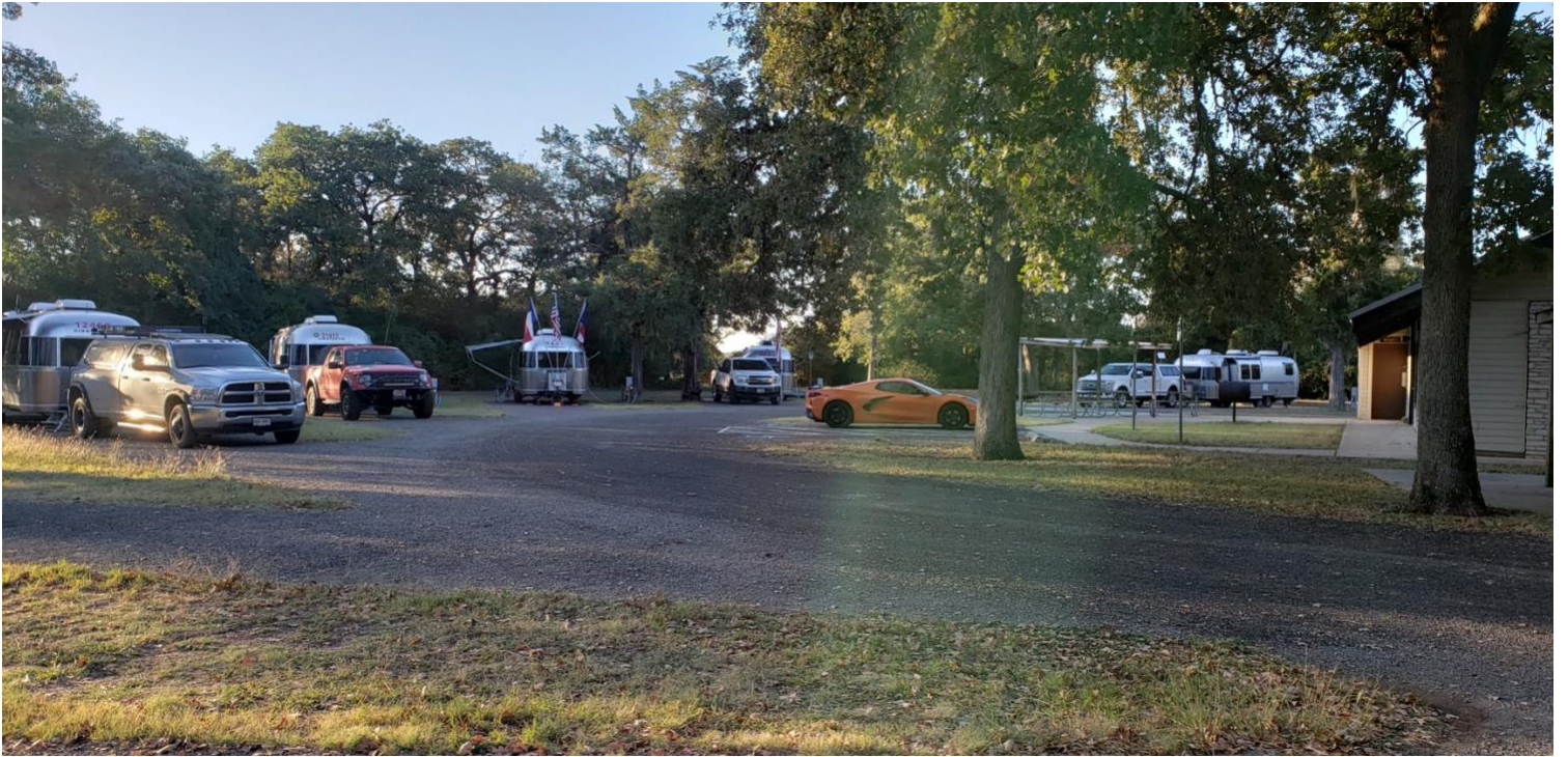
Lake Somerville State Park