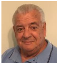
EDITOR Emilio Caragol