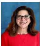
By: Linda Laviano

On departure day, Linda set up the grab and go bagel breakfast so everyone could stop by for one last goodbye and "see you down the road." Pumpkin Fest 2022 was a great success thanks to the planning of Lewis and Judi Fogel and the efforts of each of the attendees who pitched in and added to the festivities.