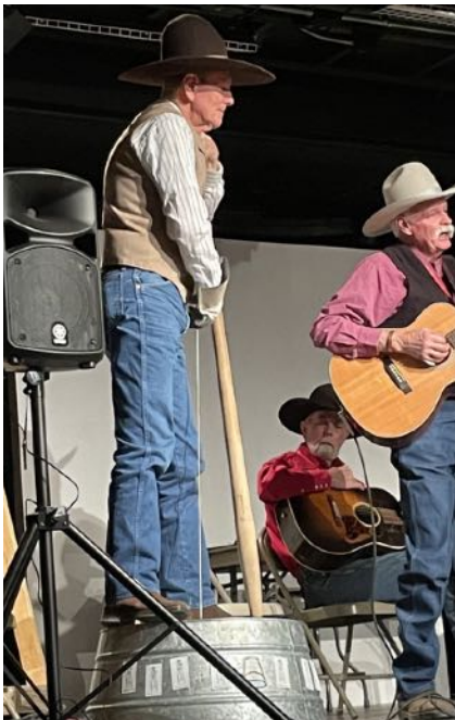
A Cowboy Poetry performance on an unusual bass instrument at Sul Ross State University