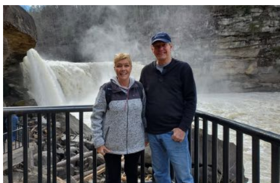
Cumberland Falls State Park, KY