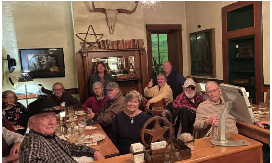
Dinner at the Reata Restaurant