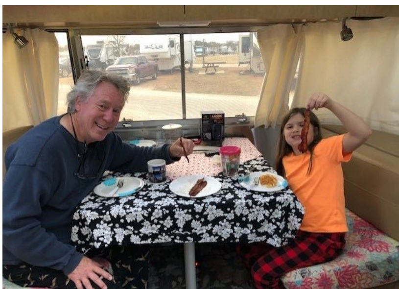
First Overnight with Grand