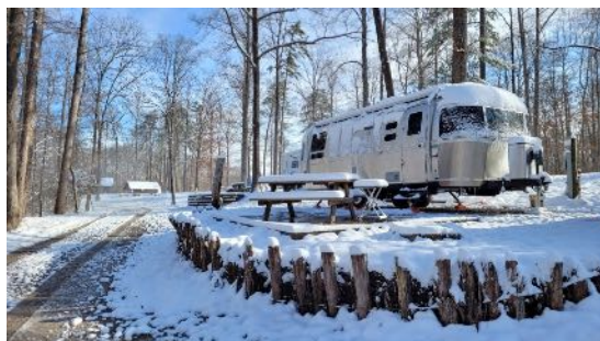
Snow day in Corbin, KY