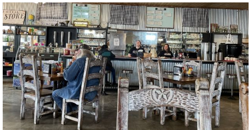
Historic Ft. Davis Drug Store Hotel exterior and interior