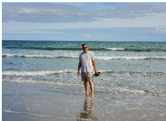
Myrtle Beach, SC