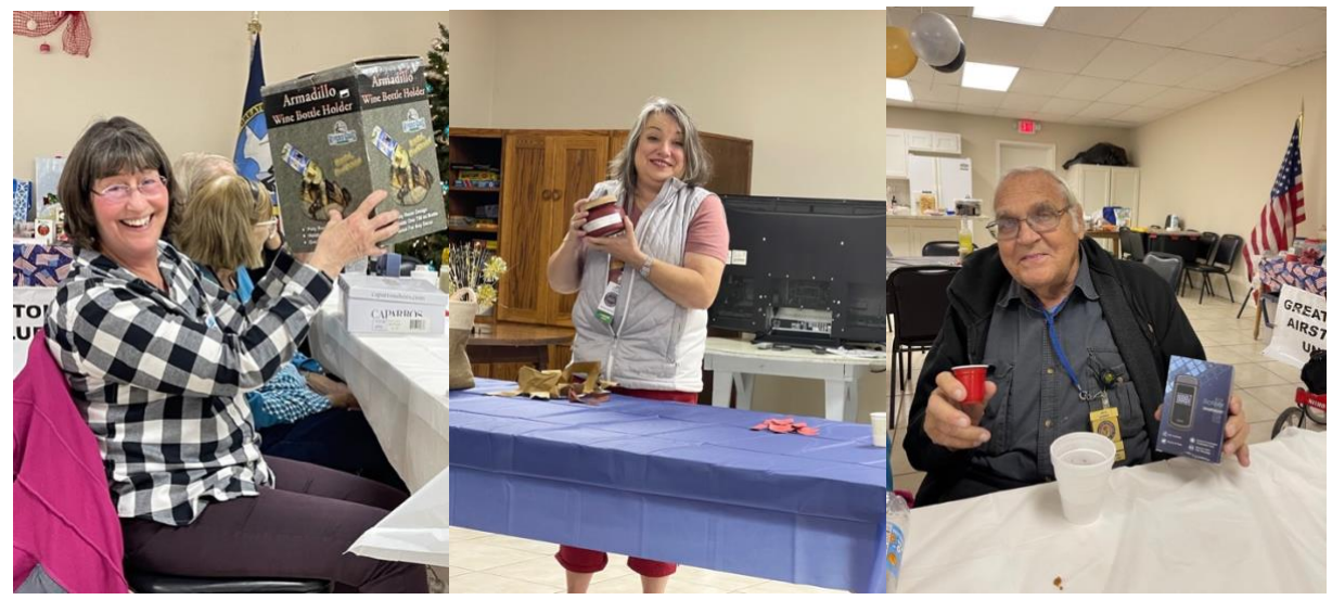
Christmas gift exchange