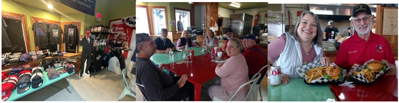
Trump Burger in Bellville