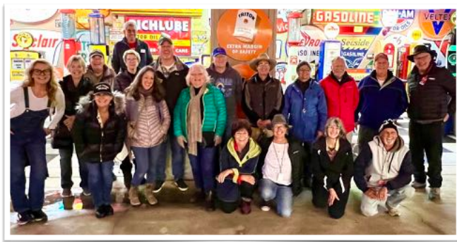
At the Mendenhall Museum

But wait, there was more! Our hosts arranged a tour of the Mendenhall Museum of Gasoline Pumps, just across the road from the RV Park. It's much more than gas pumps – it's cool, old cars and trucks and all manner of nostalgic memorabilia spread over many buildings. A focus was racing cars and we were all delighted to find clippings of Phil Grisotti's early racing days.