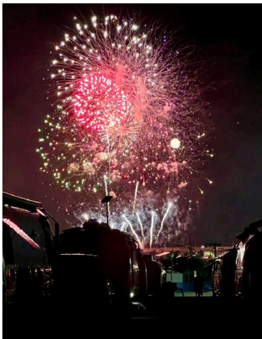
Gregg Landaker's Albuquerque Balloon Fiesta photo took 1st Place in the AfterGlow category at this year's 50th Balloon Fiesta celebration!