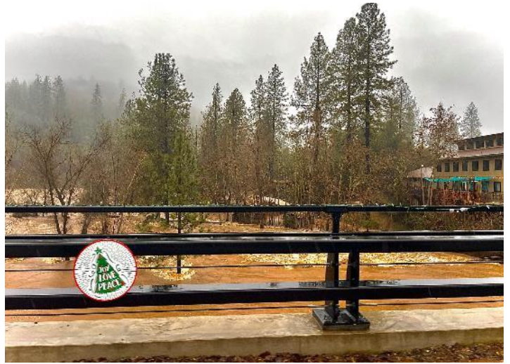
And a view of the flooded riverbank in January