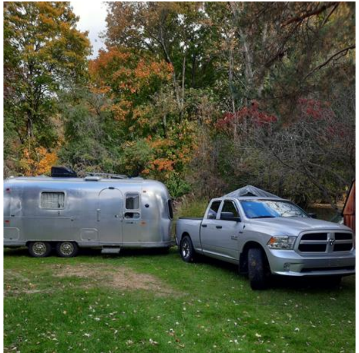
The Weimers recover from their rig/vehicle loss in 2022 with their vintage 1971 Safari and 2017 RAM 1500 replacement