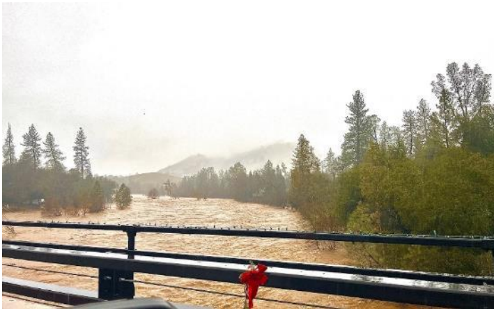
The river in full flood in January