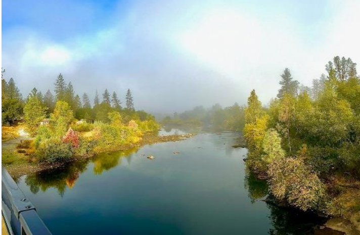
Before the deluge from the nearby bridge