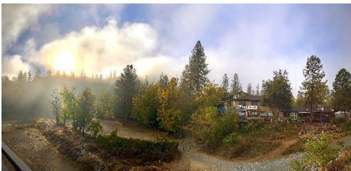
Looking to the riverbank before...