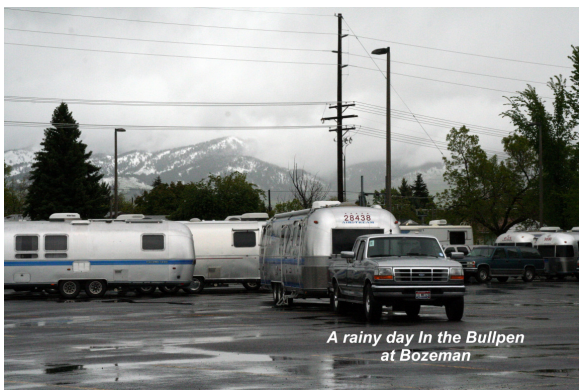
A rainy day In the Bullpen at Bozeman

Region 4 just completed their Region Award application. One of the items we can receive points for is units in the region that have unit websites. Region 4 needs to increase the number of units that have websites. WBCCI has made available to every unit the ability to create a website for free. This is a real benefit for the units as the going rate to host a website starts about $5 - $10 per month and goes up as you add features to the site. The work in maintaining a website is comparable to publishing your unit newsletter. If you would like to give it a try email us at region4@wbcci.net and we will get you the details and connect you with someone that has already done it to help you get started.