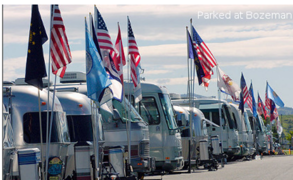
Parked at Bozeman