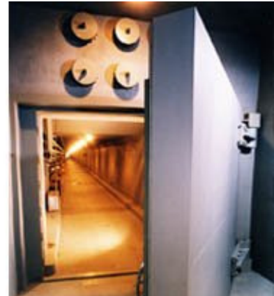
The Bunker – See It at the Region 4 Rally

First and foremost is the tour that Jim has lined up to the “Bunker” that is housed below the famous “Greenbrier” America’s Greatest Resort, located in White Sulphur Springs, a facility that was the greatest government secret ever kept. It was the former U.S. Senate and House of Representatives Relocation Facility in the event of a national emergency. Planned by the Eisenhower Administration and built between 1958 and 1961, the secrecy of its location was maintained for more than 30 years until May 31, of 1992 when The Washington Post published a story exposing it. Don’t miss this chance of a lifetime to visit this famous historical site.