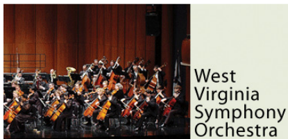
West Virginia Symphony Orchestra