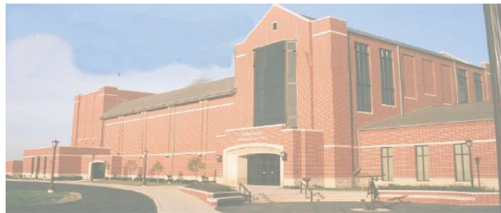
Tour: Newsonger Performing Arts Center