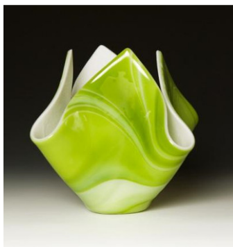
Tour: Buehrer Glass Studio