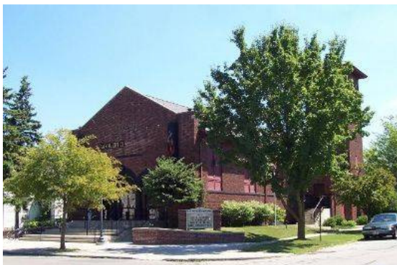
Tour: Van Wert Civic Theatre