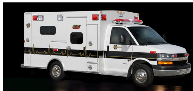
Tour: Braun Industries