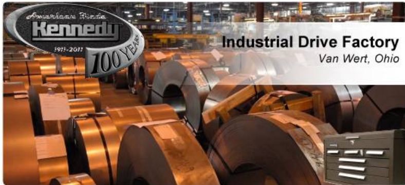
Tour: Kennedy Manufacturing