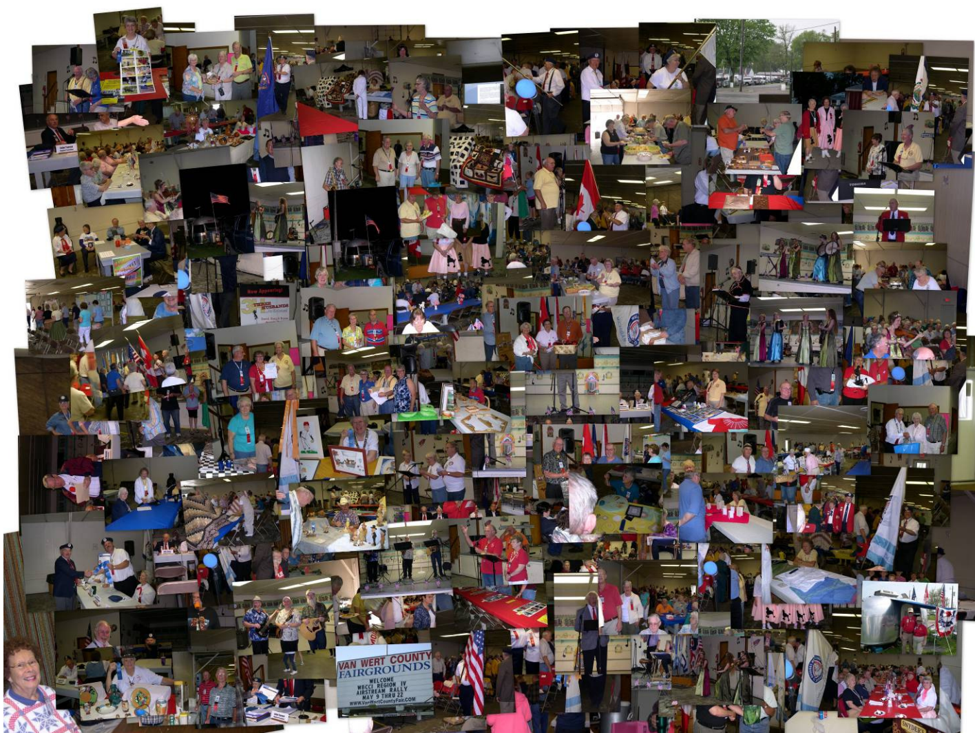
Photos from the 2011 Region 4 Rally at Van Wert