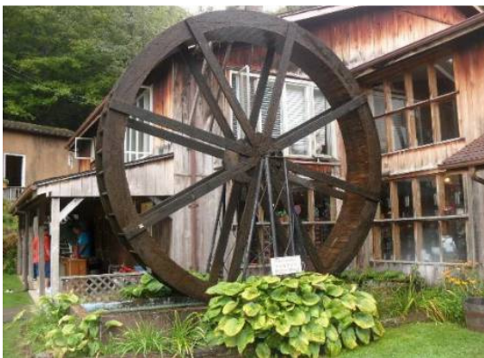
Lost World Caverns