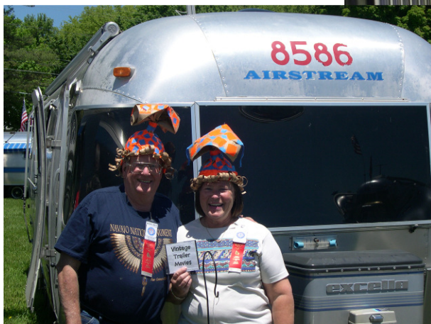
at the 2009 Lewisburg Rally