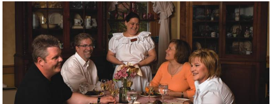
General Lewis Dining