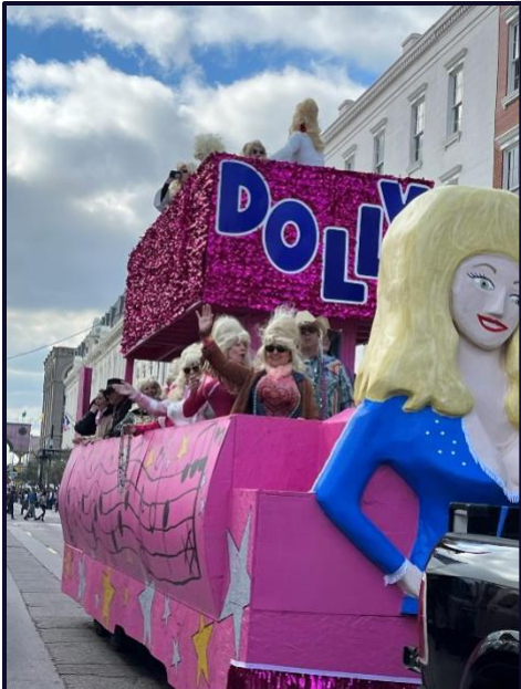
The Dolly Parton Float, then Tom met up with Dolly later.