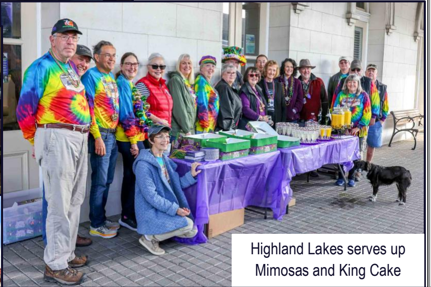
Highland Lakes serves up Mimosas and King Cake