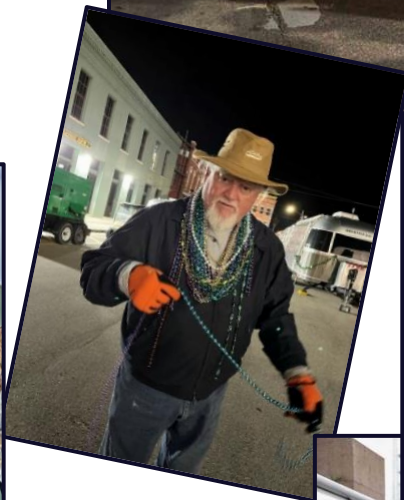
Grabbing for beads! Mardi Gras Crocodile comes calling.