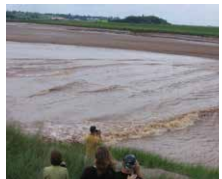
Above, top to bottom: Blockhouse at St. Andrews, New Brunswick Celtic Cross at St. Andrews, New Brunswick Sir Williams Van Horne Home, New Brunswick Tidal Bore, Truro, Nova Scotia