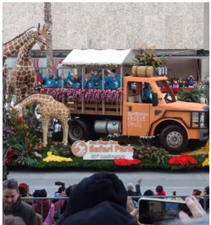
Photos from the Rose Parade, Pasadena, California, New Years Day, 2023. Note the Penn State Band!