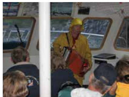
Above, top to bottom: Entering ferry to Newfoundland Rose Blanche Lighthouse, Port aux Basques Northern pitcher plant Bonne Bay boat ride evening sunset Bonne Bay captain