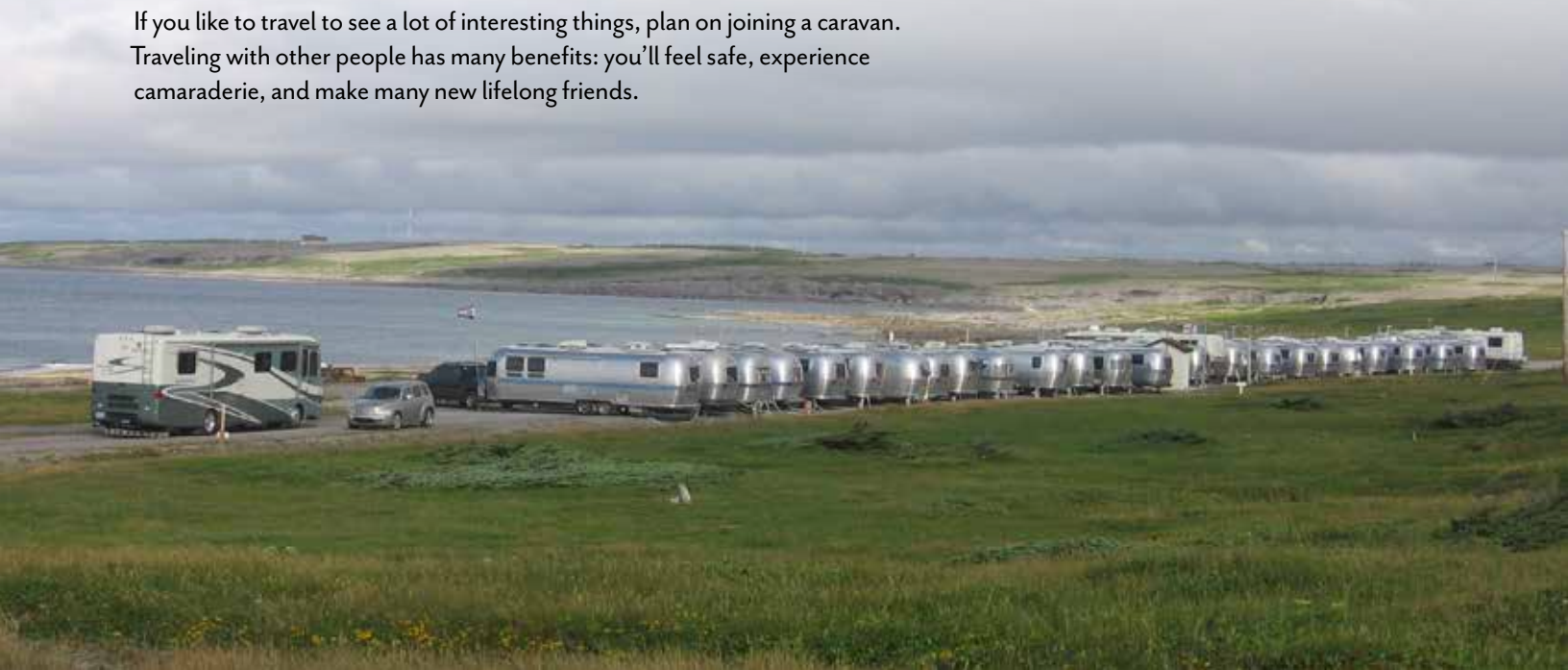
Background: Port Au Choix camping spot