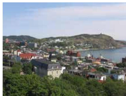
Above, top to bottom: Iceberg at Twillingate Silent Witness Memorial, Gander St. John's town