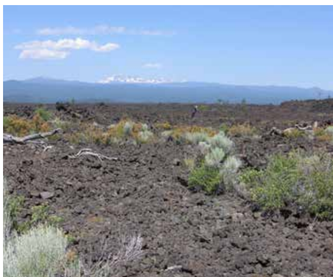
Above: Golden Gate Bridge; Redwoods; Crater Lake Lava Butte