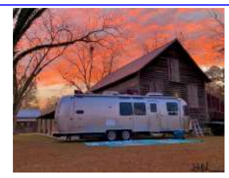
Sunset at Stink Week