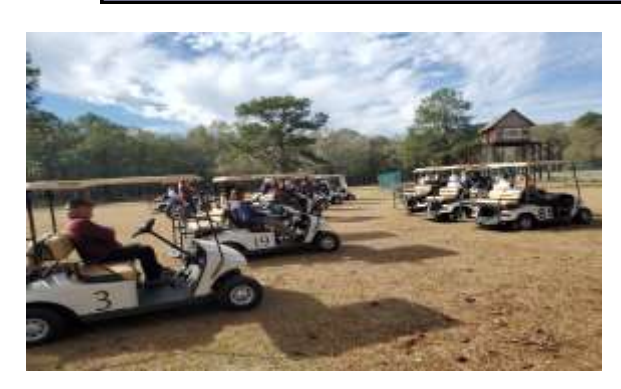
"Trail ride" at Spirit of the Suwannee Park 2022

This event will be a two park rolling rally. It will start with 3 nights at the Spirit of the Suwannee Music Park near Live Oak, FL, March 3 - 6. This is a park with 800-acre campground located on the historic banks of the Suwannee River. There is a boat launch on site and lots of hiking/biking trails, so don't forget your paddle craft and bikes. Golf carts can also be rented.