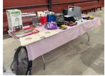
How about those mason jar bags? Brilliant! A great alternative to glass jars in the RV