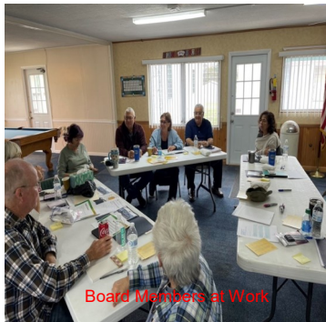
Board Members at Work

I am so proud of our club members and our Board of directors. We have been told by many people in the region just how special unit 30 is. And I must confess, I think they are correct. That said, we are always looking to improve our game. And for that reason, I asked our Board to meet and spend an entire