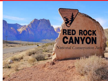
Red Rock Rally

Check the Las Vegas Airstream Club Event Calendar for current and future rallies https://airstreamclub.org/las-vegas