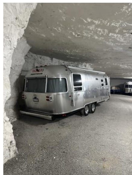
PHOTOS FROM OUR TRIP TO THE EAST BRADY UNDERGROUND STORAGE FACILITY. THIS IS THE AIRSTREAM ROOM. WE GOT TO SEE OUR TRAILER, THE GIBSON'S TRAILER, AND THEN WENT TO WHERE OUR '63 IS STORED.