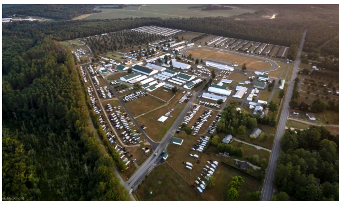
2022 International Fryeburg Rally from the air—can you count all 960+ units at the rally?