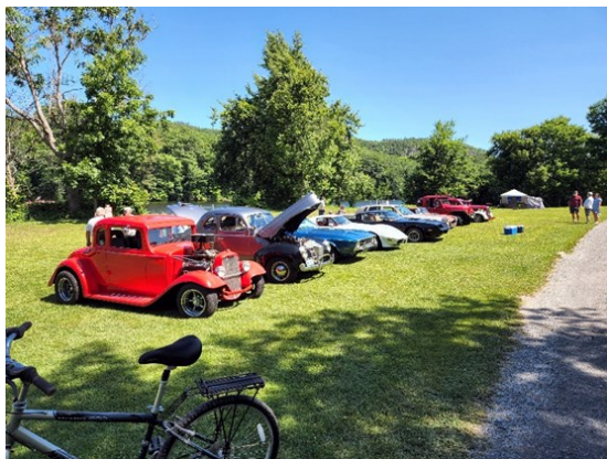
Antique Car Show on the shore of the Connecticut River