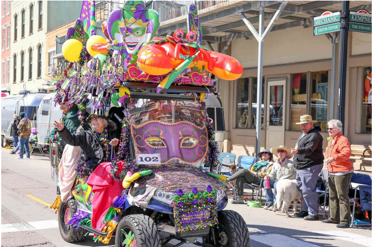
Marching Bands, Art Cars and Zaniest Golf Carts on Parade