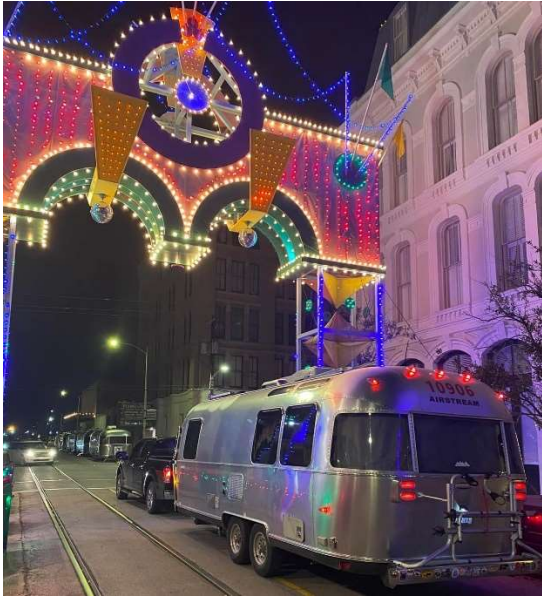
Parking the Airstreams on The Strand