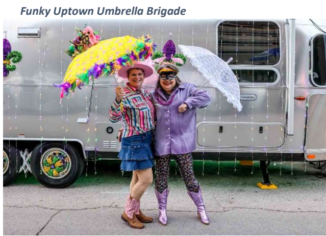
Funky Uptown Umbrella Brigade