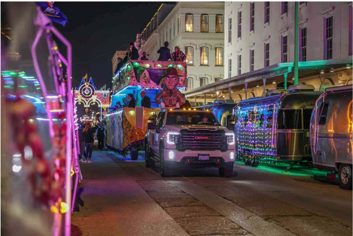
Floats from several Krewes passed by the Airstream lined Parade Route