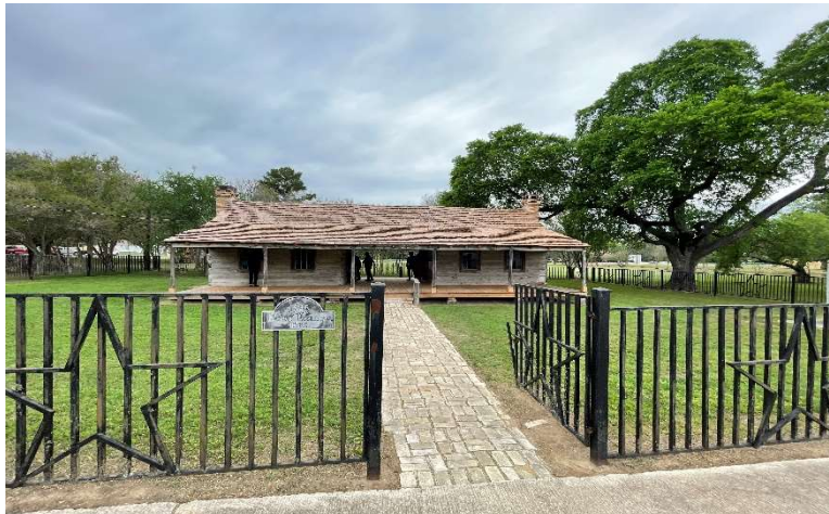
1845 Horace and Sarah Eggleston "dog run" cabin