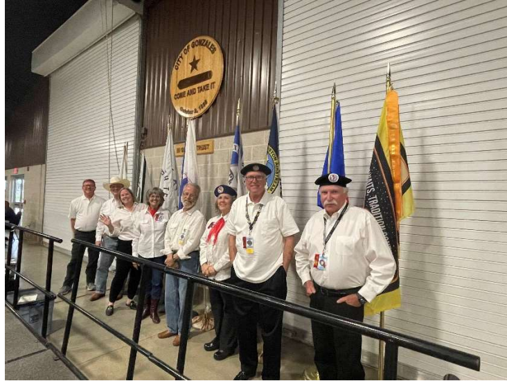
Region 9 Unit Presidents