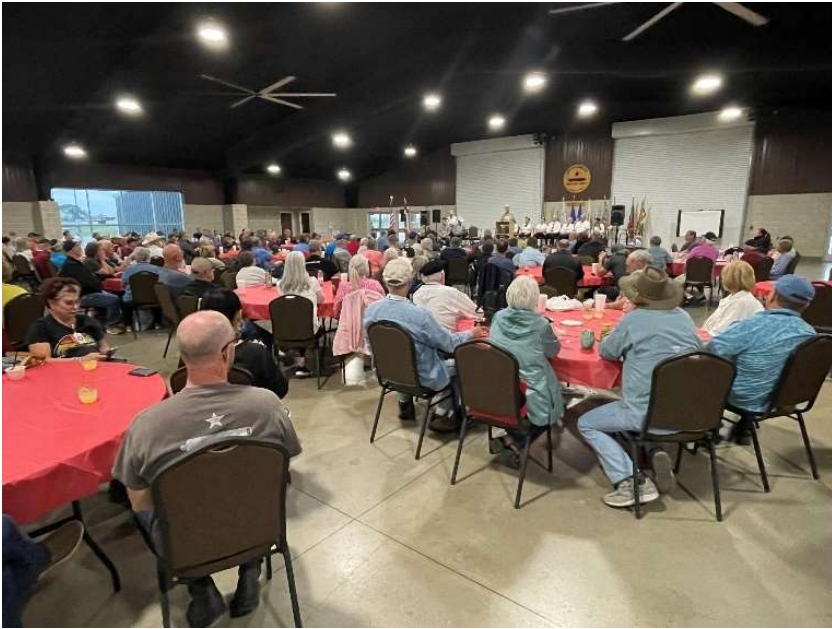
Region 9 Board & Member Meeting