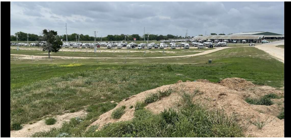
View of our March rally site

The town of Gonzales was established in 1825 by Empresario, Green Dewitt. Today it has over 7100 in population and remains as it was originally surveyed. It is famous for its refusal to return a small cannon Mexico demanded having sent 120 soldiers from San Antonio to retrieve it. The Texians of Gonzales fired the first shots of what became known as the Battle of Gonzales successfully resisting the Mexican forces and keeping the cannon. Our Region 9 attendees gathered at the Gonzales Memorial Museum at 1414 Smith St to hear an account of the history of the “Come and Take It” cannon as well as the building of the Museum honoring the 32 Gonzales men and boys who rushed to help defend the Alamo in 1836 joining Col. William Travis and the other heroes who lost their lives in the Battle of the Alamo.