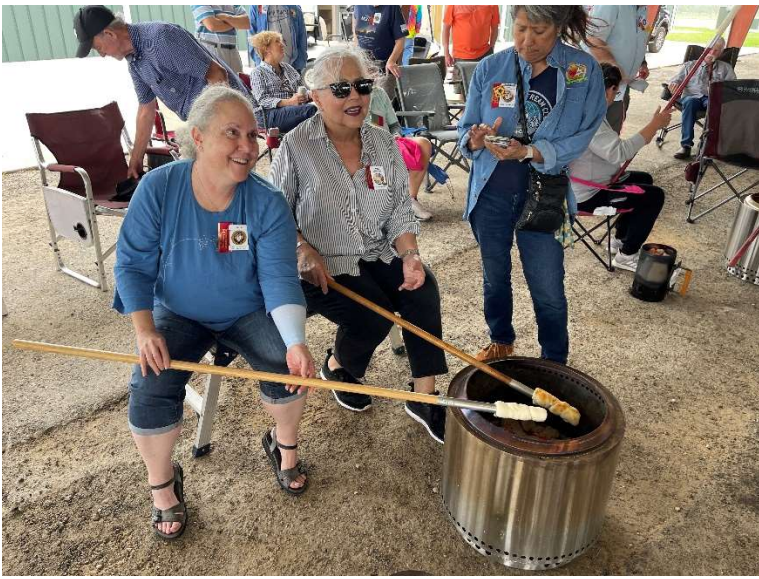
Ladies cooking their biscuits on a stick