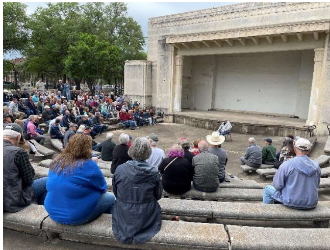
Story of the "Come and Take It Cannon" at the Gonzales Memorial Museum