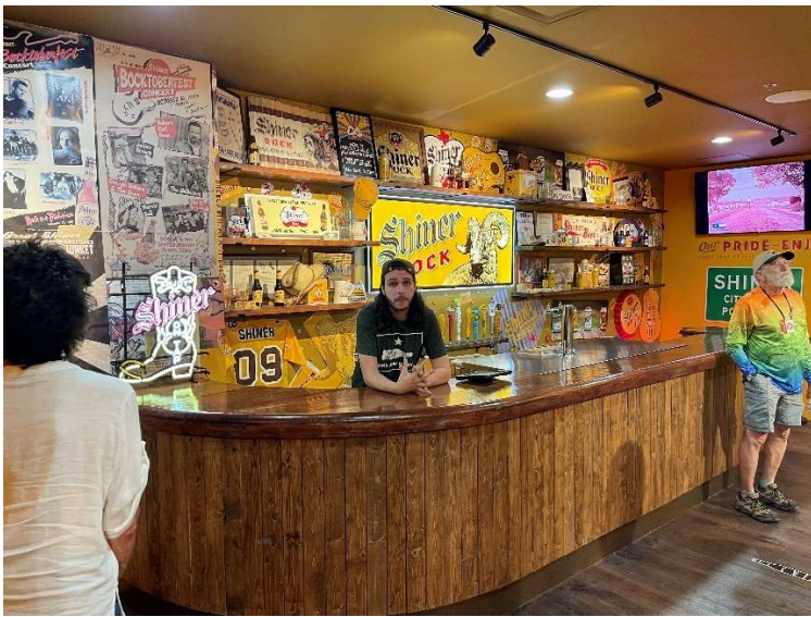
The bar at the Spoetzl Brewery in Shiner, TX