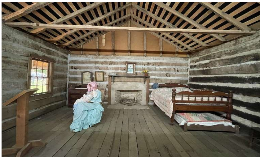
Interior of Eggleston cabin depicting frontier life