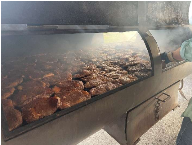
Mouth watering ribeye steaks!