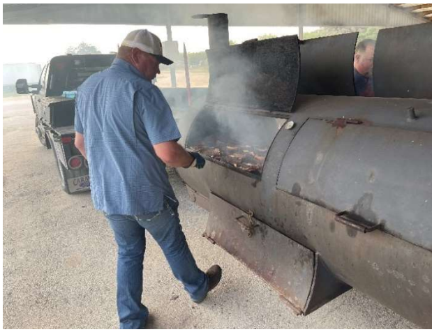
Baker Boys BBQ grilling over 200 ribeye steaks for us