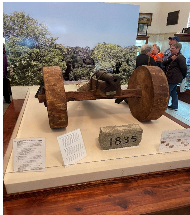
"Come and Take It Cannon"

Whan that Aprille with his shoures soote, The droghte of March hath perced to the roote, And bathed every veyne in swich licour... So goes the first prologue of Chaucer's Canterbury Tales written in Middle English in the 14 th Century. Translation: When April with his showers has pierced the drought of March to the very root, and flooded every vein with sweet liquor... The beginning of Chaucer's collection of 24 tales of different travelers on a pilgrimage to a shrine. I can still quote these lines some 56 years after being required to memorize them in senior English class as I'm sure many of you did as well. We have just completed our Airstream Region 9 pilgrimage to the cannon shrine in Gonzales, Texas where the first shot of the Texas Revolution against Mexico 1835-36 which resulted in the birth of the Republic of Texas. As 105 Airstream rigs camped near the Guadalupe River at the JB Wells Event Center, I'm sure many Tales were told by our Texas and Oklahoma members recounting our travels, assorted backgrounds, families, jobs, and plans for this year's International Rally in Rock Springs, WY.