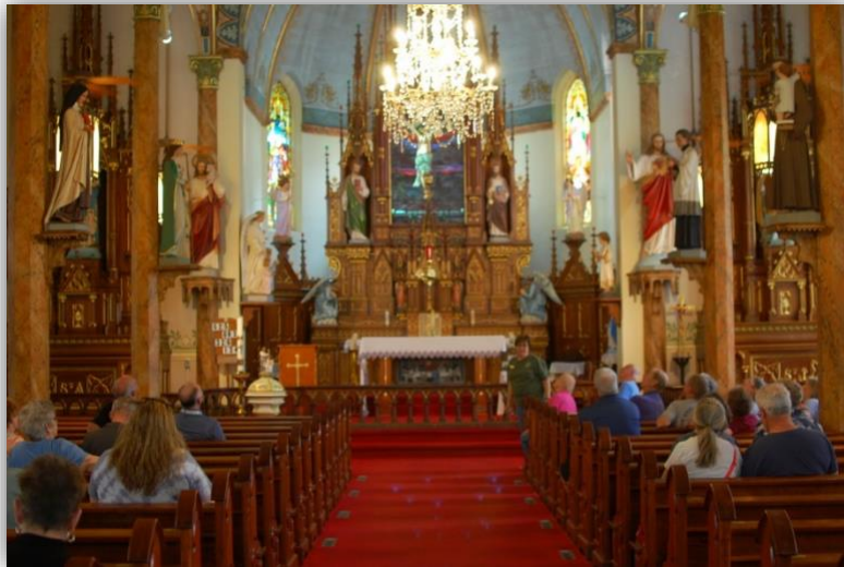
Painted Churches tour