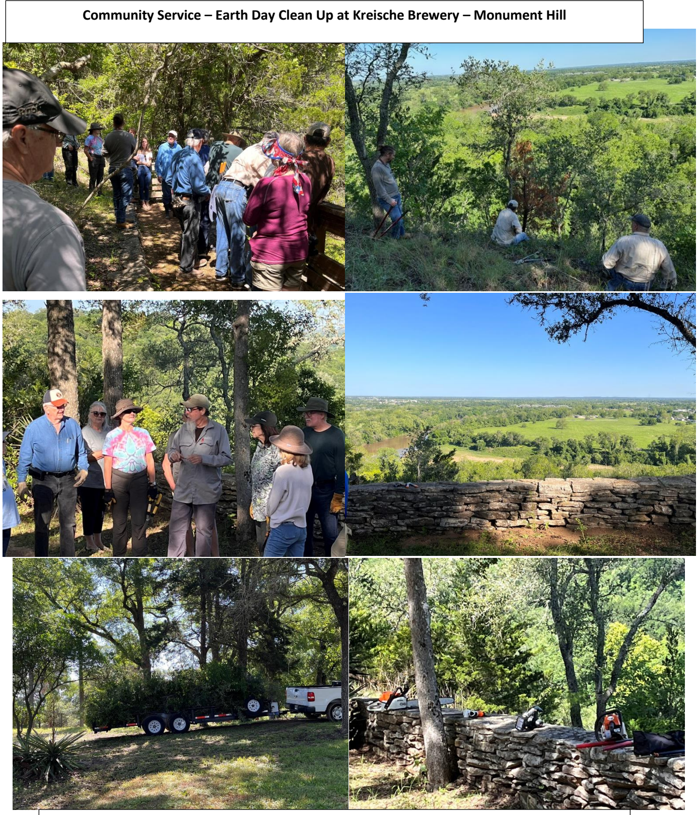
One of the two trailers of brush cleared by GHAC Volunteers along with some of their tools.