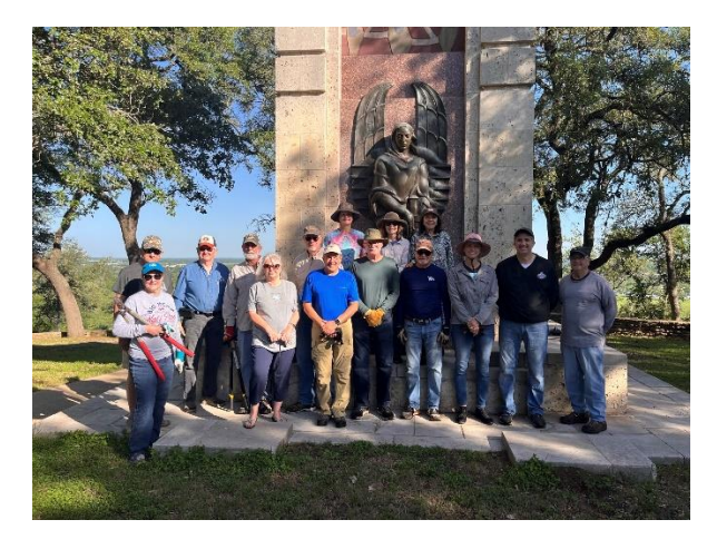
Cleanup Volunteers-Kreische Brewery - Monument Hill