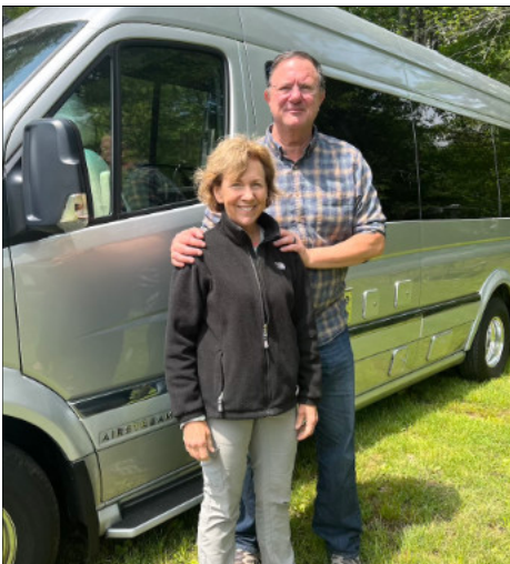
Happy to be camping with our Airstream friends again.