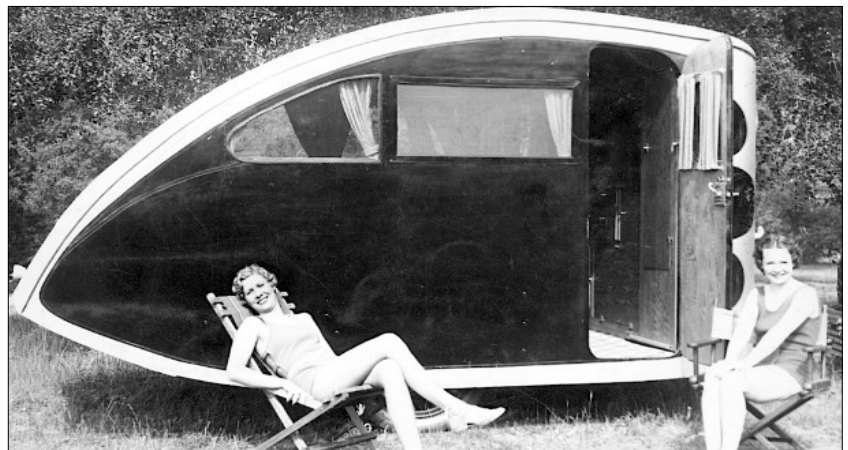
This is a 1935 Airstream 14' Torpedo trailer. Wally Byam sold these plans by advertising in the back of Popular Mechanics Magazine. Apparently Wally knew how to attract attention.