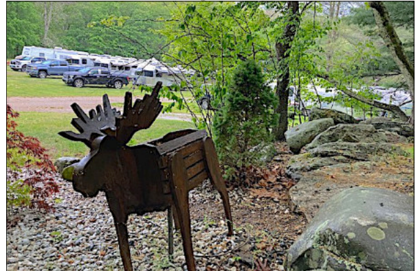
Silver at Moose Meadow Campground.