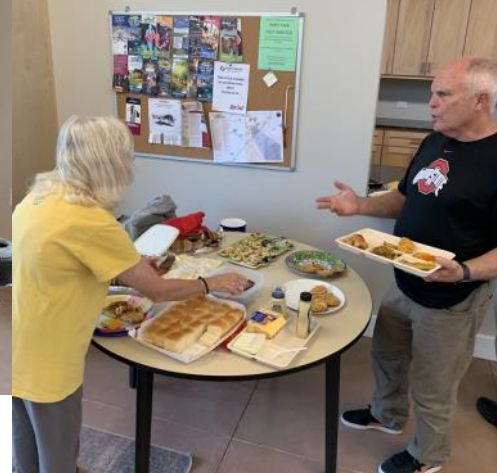
April San Marcos Rally (continued)