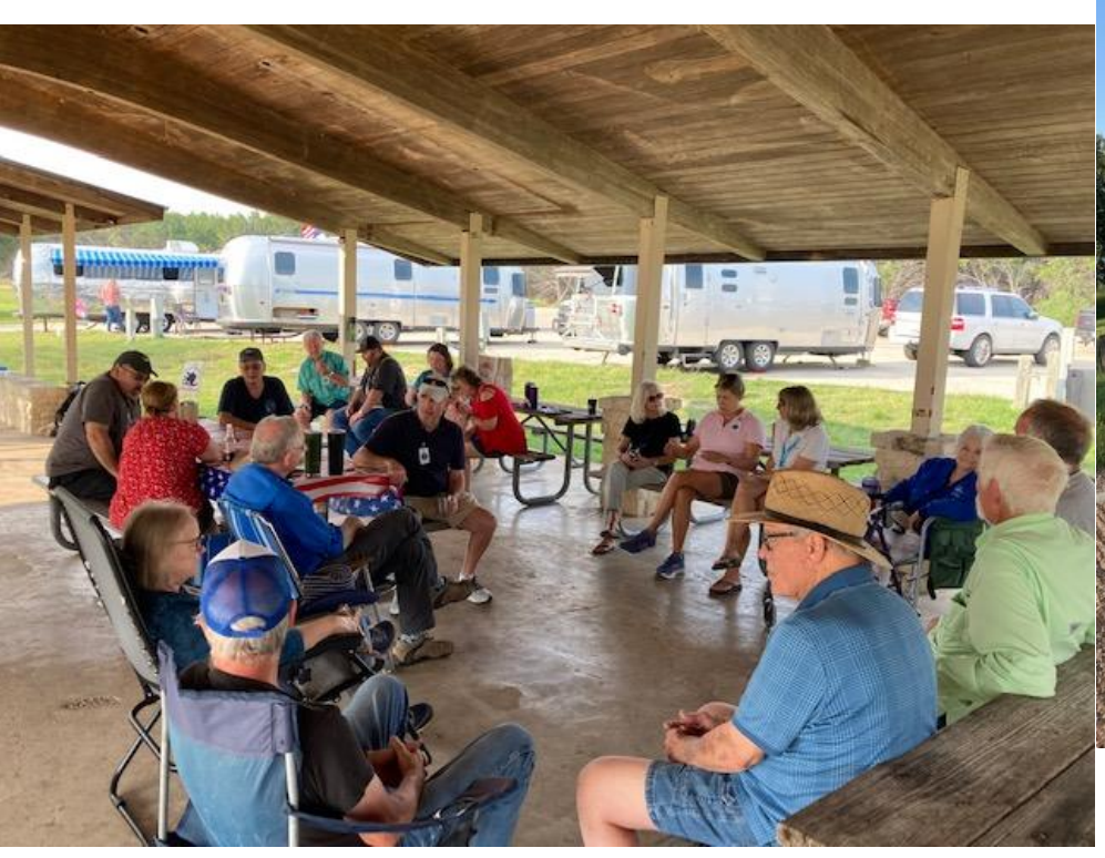
Photo below is a get together under the group shelter. That is a very nice shelter!!

Photo on the right is from the Fegley's site. This was their view as they drank their morning coffee.