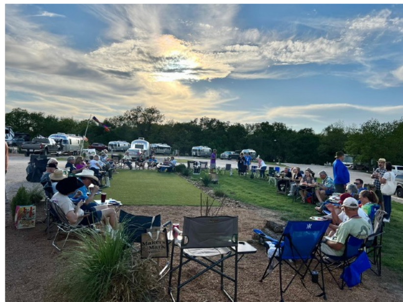
Enjoying a pitch in dinner at the Sip of Texas Rally.