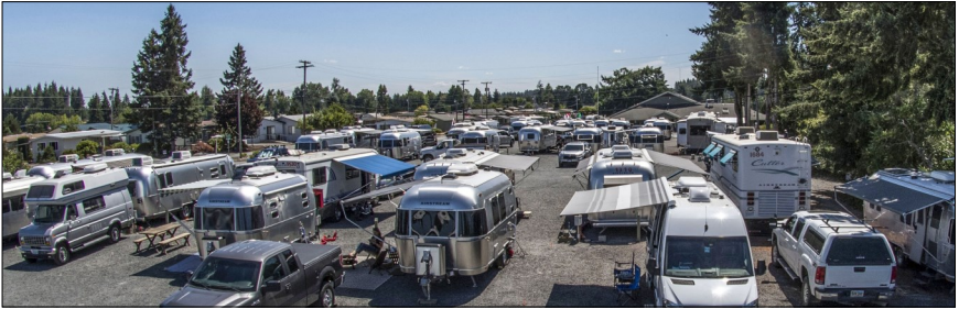
The Airstreams gather in the Terraport