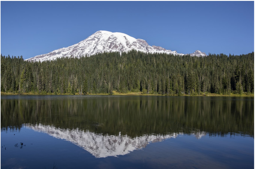
Mount Rainier from Reflection Lake