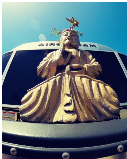
Calming presence