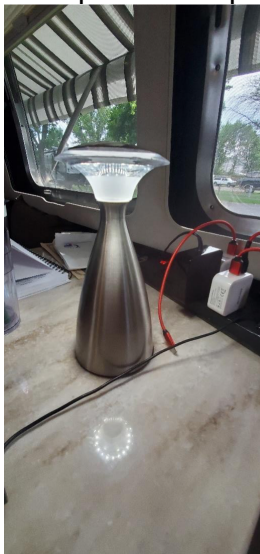
Touch lights. Battery operated and three different intensities just by tapping top. There are others that are solar, but these have worked very well for us for years. So much easier than having to get up and go to the control panel to turn lights on and off.