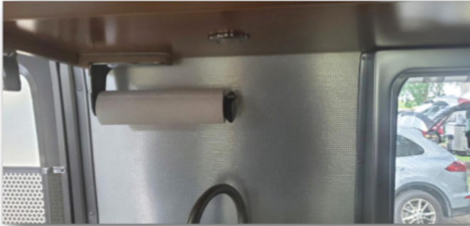
Paper towel holder over sink. Again, mounted to 3/4" plywood and Velcro on cabinet. Has never come off during travel and no holes in the cabinetry.