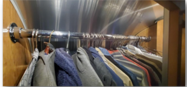
We've replaced the black ribbed bar in every trailer we've owned with a heavy-duty chrome bar and accompanying ends...one solid and one slotted. Far easier to arrange clothes and at least in my opinion, looks a lot better.