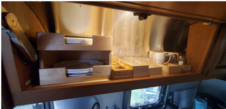
I've made plywood holders for all our plates and glassware. Correlle plates and real Schott Zwiesel glassware. It's a luxury because life's too short for us to drink out of plastic all the time. The dinner plates are separate from the salad plates so I don't have to remove something to get to something else underneath. The back sides of these are curved to fit the curve in the Airstream. Therefore, larger plates go on the bottom, smaller plates on top.