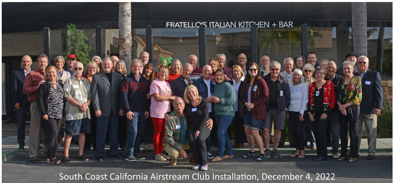
South Coast California Airstream Club Installation, December 4, 2022