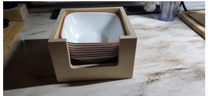
Holder for the bowls which work out great also for preparing mise en place . We have never had anything break or shift when traveling. And even if they were to shift, they would stay in their containers.