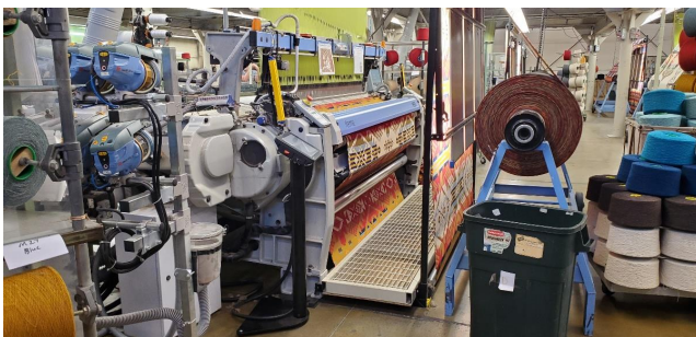
Pendleton Woolen Mill