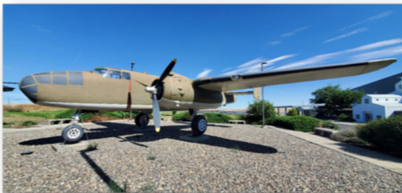
B-25 like the ones flown in the Doolittle Raid

Today is day 14 of our trip. When I last posted we were driving through North Powder, Oregon, on our way to Wildhorse Casino RV Resort just outside Pendleton, Oregon. We are just 7 miles west of Pendleton at the casino and have had 3 wonderful days and nights in Pendleton. This is a beautiful park in the middle of the wheat fields. Pendleton is a delightful town. It is best known for the Pendleton Round-up. It is a major annual rodeo held at the Pendleton Round-Up Stadium during the second full week of September each year since 1910. The rodeo brings roughly 50,000 people every year to the city. The most fascinating tour awaited us, however. The Pendleton Underground Tour...It's about brothels, booze, Chinese, tunnels, speakeasy's, meat market, ice...the works. No visit to Pendleton is complete without a visit to the Pendleton Woolen Mill. This was a short tour, noisy, and well worth it. Sunday morning, we were treated to a tour of the Pendleton Army Airfield which was just fascinating. Here's something you probably didn't know. The Doolittle's Raiders trained at Pendleton Army Airfield.