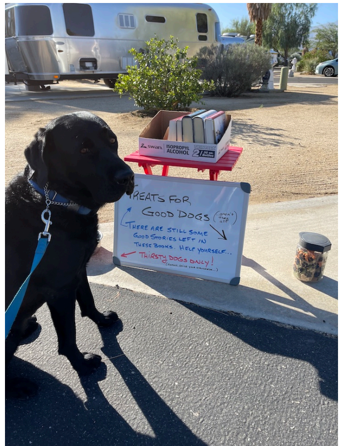
Are there any good dogs here?