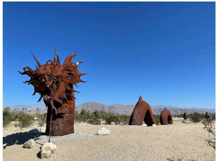
One of the Galleta Meadows sculptures