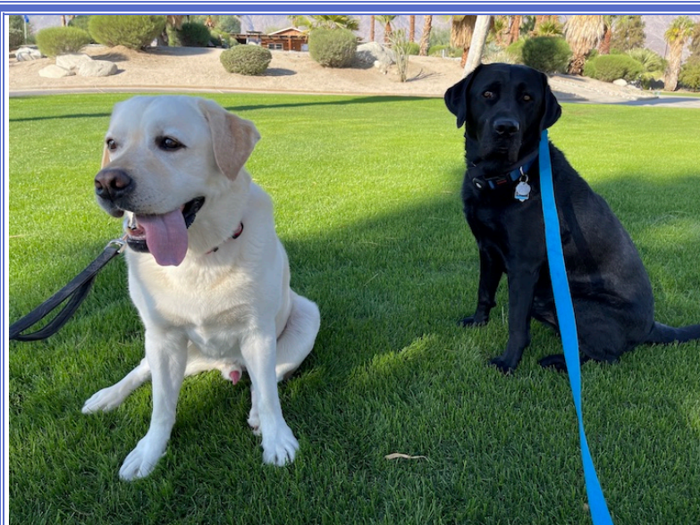
Two good dogs.

Also, Apple Pay and Google Pay alternative payment options are coming soon for our members who prefer a completely digital secure payment method without entering credit card information.