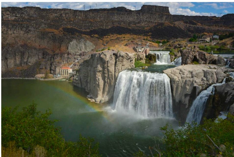
Shoshone Falls Park, Idaho