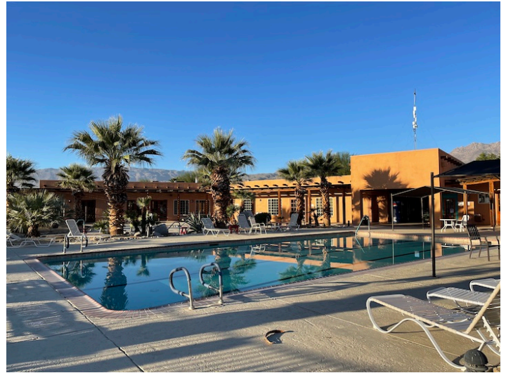
Serenity by the pool