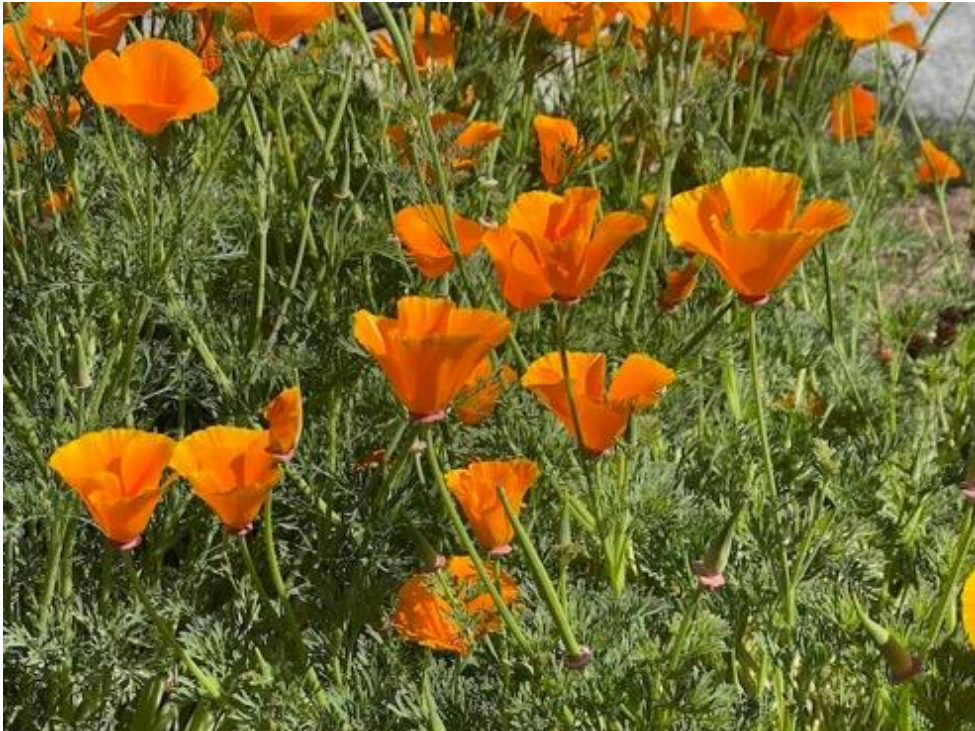
Spring has sprung in California, with our state flower, the poppy, in bloom everywhere.