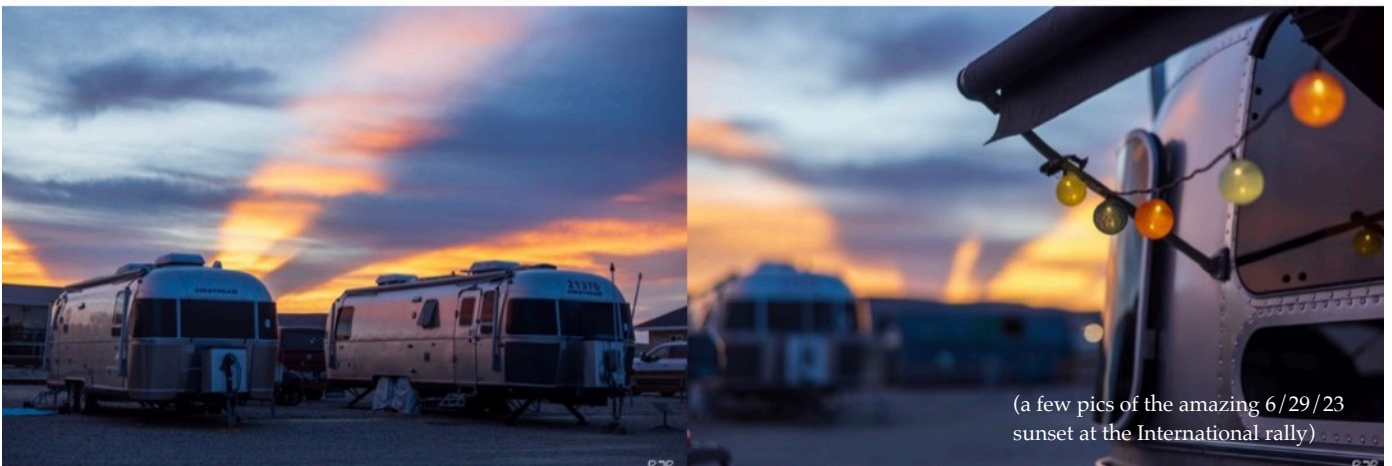
(a few pics of the amazing 6/29/23 sunset at the International rally)