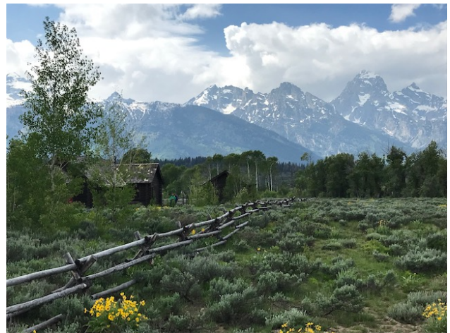
Magnificent Teton Range

If you have never been to the International Rally, it is an event that you should put on your calendar. Next year's rally will be in Sedalia, MO, October 5-11, so it will be closer to us. Registration is now open, so you can go online and register. This year's rally sold out, so if you think you might want to go, register now.