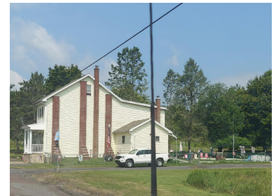
Abandoned road in Centralia (left). One of the homes left in Centralia (right). There looks like 5 chimneys but four of the brick posts are for support since the home that was attached was demolished. The brick pillars were built for structure stability.