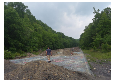
Left: Centralia street and sidewalk. Right: Abandoned graffiti highway