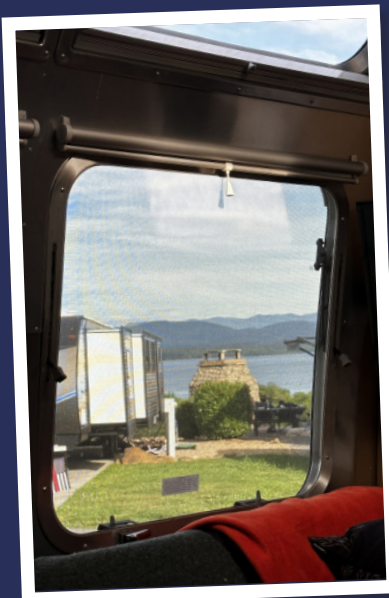
Workday view of the Great Smoky Mountains from Anchor Down RV Resort, TN