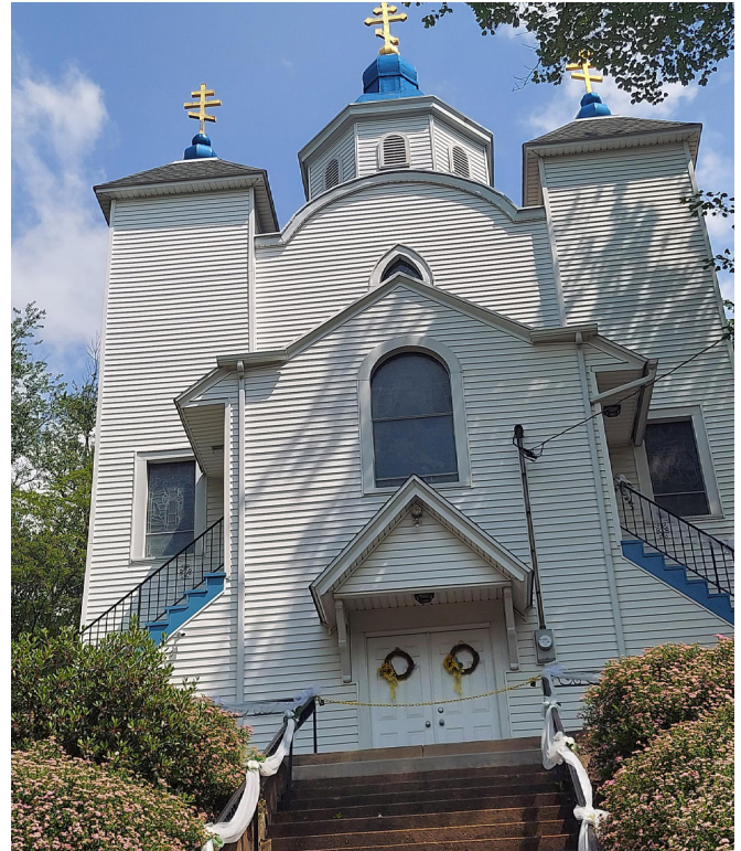
Still standing: Centralia's Ukrainian Catholic Church