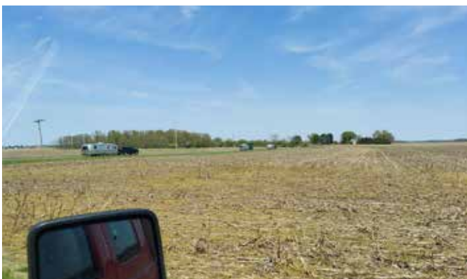
The Rolling Caravan/Rally continued to Indian lake State Park, OH