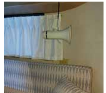
Inside the Gold Trailer is Wally's bullhorn. His rally cry during Caravan meeting times: "Hurry, hurry, hurry, meeting time" called out carnival-style in the bullhorn.