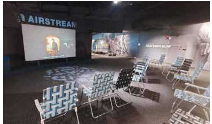
Sit back and enjoy the company's best film and video projects undertaken over the last nine decades. From vintage archival footage to some of the favorite newer pieces. -viewing area at the Heritage Center. Can also view at: www.airstream.com/blog/a-digital-airstream-film-festival-90-years-of-incredible-movie-making/