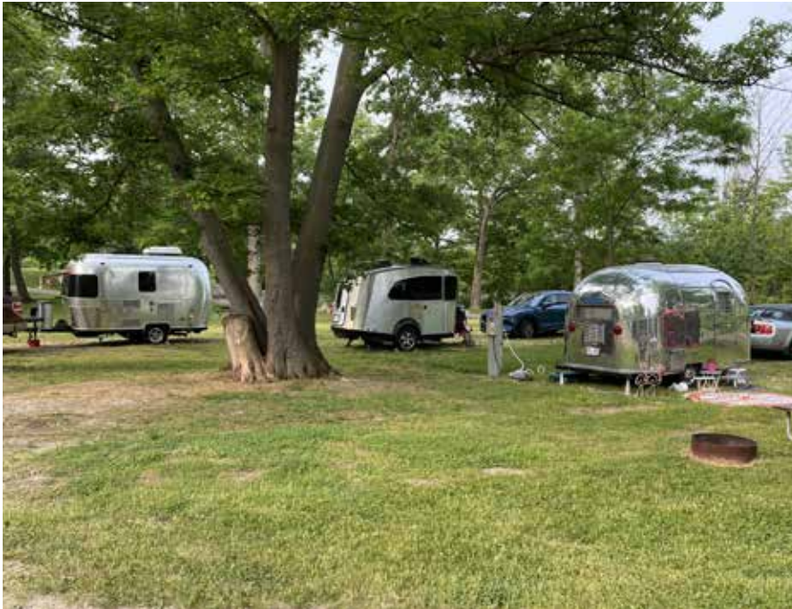
Above Young and old Bambis with a Basecamp

The days before and after the rally were left to explore the area. Jellystone Park is located only 20 minutes from The Falls. During this time, we visited the Falls, the quaint town of Niagara-On-The-Lake, Niagara Parks Power Station, Welland Canal and area wineries. Special Thanks goes out to the Rally Committee, Hosts and Sponsor for putting on such a Great Rally. For those that have not been to a Region 2 Rally, there is Next Year.