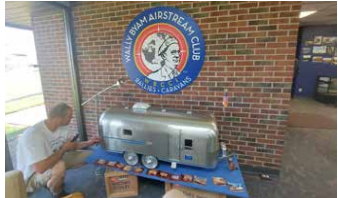
Karl checking out the Airstream model displayed at the Airstream HQ office.

After our tour we headed back to our trailer to pack up for the rolling rally to move onto Indian Lake State Park, which was only about 20 minutes away. This state park is now one of our favorites as it is waterfront and a lot of sites back up to inlets which allow for fishing and calming night fires by the water at your site. Of course, evening dinners consisted of plenty of delicious food and even breakfast on Saturday which we helped with by making pancakes to go with the eggs and bacon. Matt had the wonderful idea of getting a tour of the lake, so he