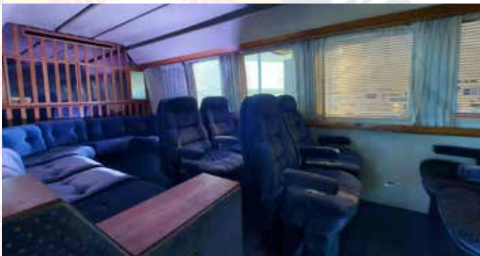
Inside the 1984 Airstream Funeral Coach. This could transport 14 family members, a casket & up to 20 baskets of flowers.