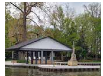
The Indian Lake State Park is now one of our favorites. A lot of the sites were on the inlet. We went for a lovely boat tour of Indian Lake. Our guide was very informative! Indian Lake is a 5,100-acre lake. It even has its own Statue of Liberty!