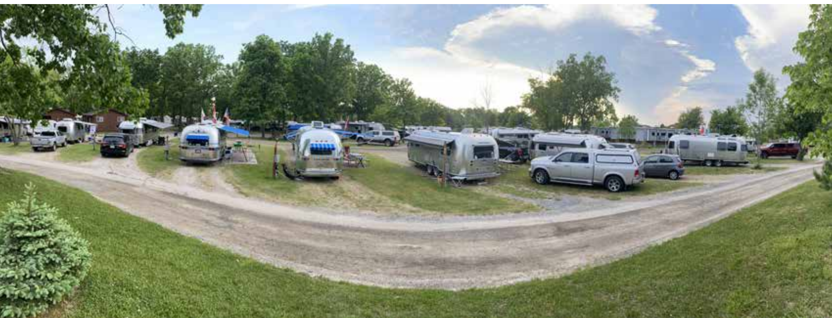
Below: Pano of Airstreams at Rally