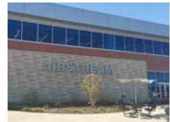
Left: While visiting with the HQ team, they informed us of the new offer from Solo stoves. You can now purchase with the option with the airstream logo and in multiple colors! Right: The new Airstream factory for the travel trailers.