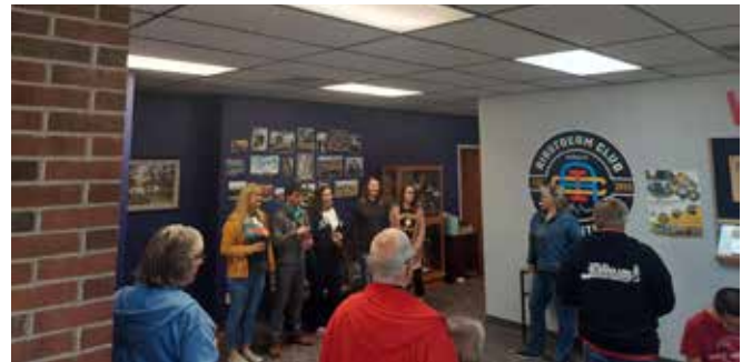
Friday morning meeting at Airstream Headquarters where we had a chance to chat with the HQ Team!